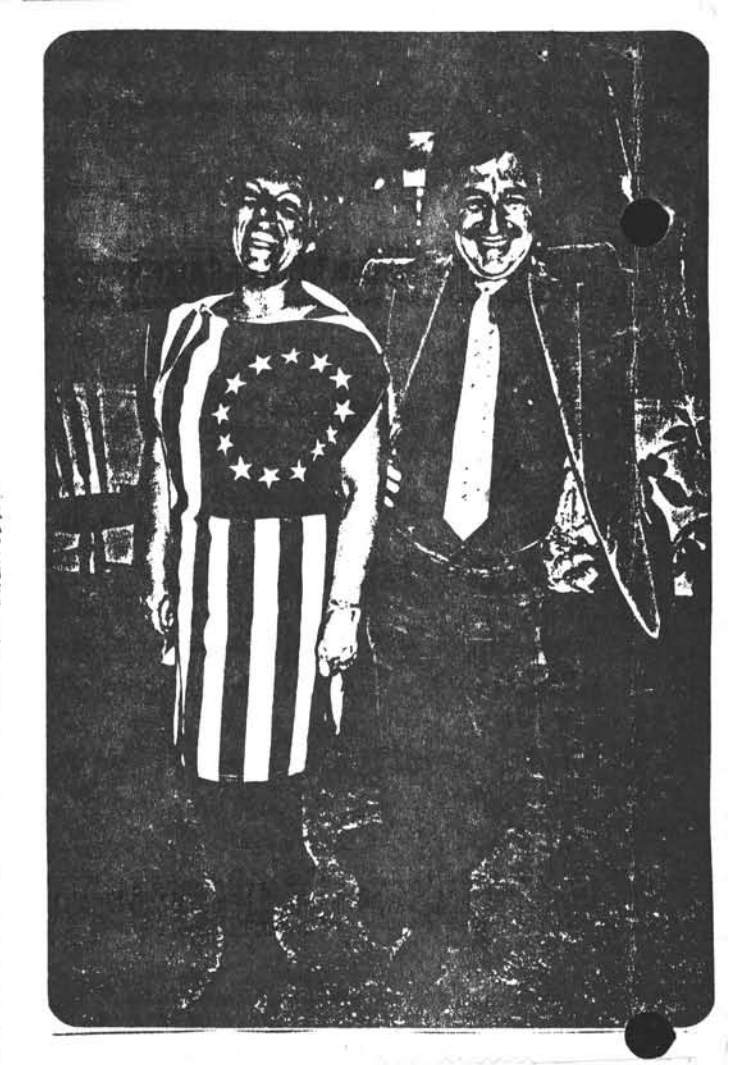
TIDEWATER MG 'T'CLASSICS 7704 BERGEN STREET NORFOLK, VA. 23518