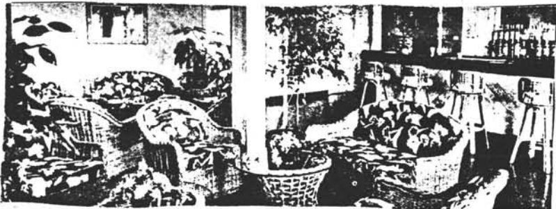
PHOTO: BAR, THE TILGHMAN INN

REMINDER: If you do not pre-register for the banquet, you may not be seated. This is so that those who do pre-register get to eat. Also, registrations at the door for MINI-GOF are double the price. A good event requires advance planning.