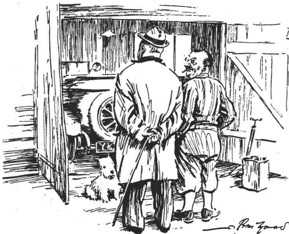
Prospective Purchaser: 'What's she like on hills?' Owner: 'Hills! Down 'em in a jiffy.'