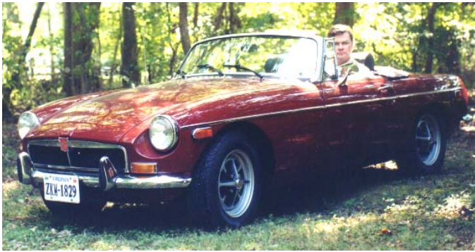
Pig Pickin' 1998