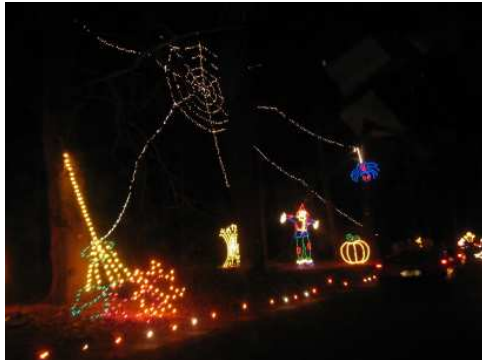
Loved the spider web

What a great assortment of cars too! In addition to Bs there were three GTs, and even an MGA. Everyone (except the GTs of course) was able to enjoy a “top-down” tour. (Well, I did have a sun roof).