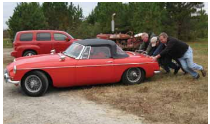
One last push! “We’re so tired!”