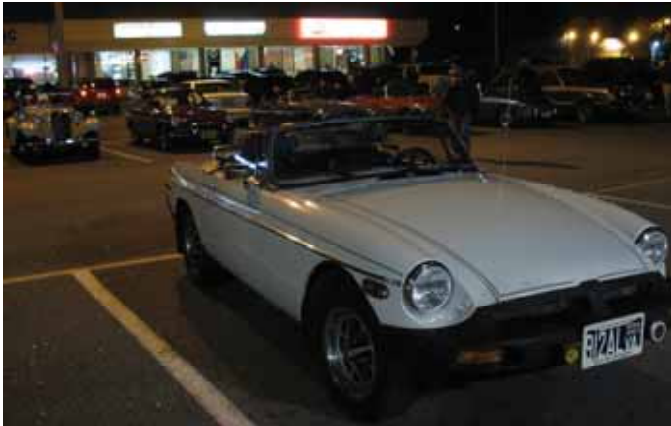
Everyone met up at Franco's Italian Restaurant for dinner before the tour.