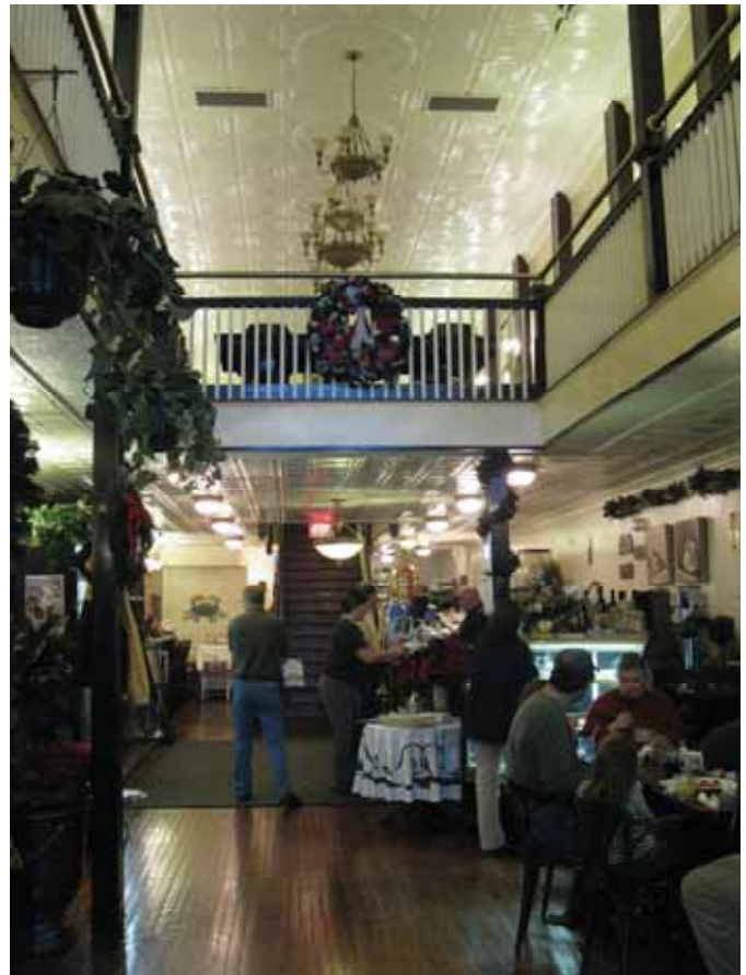
Cape Charles Coffee House

pongo and Chatham Vineyards. Owned and operated by the Wehner family, Chatham is hailed as a European-style vineyard. We MGs wondered why no one ever makes a fuss over British wineries. However, we waited patiently outside while our humans spent what must have been an exhausting hour sampling exotic liquid fuels. I say this, because we immediately made our way to Onancock and Mallard's at the Wharf, where they could fortify themselves with lunch.