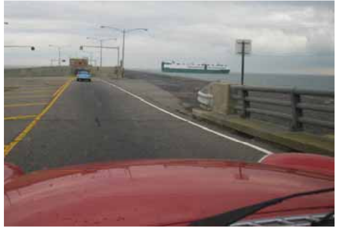
Crossing the Chesapeake Bay Bridge Tunnel