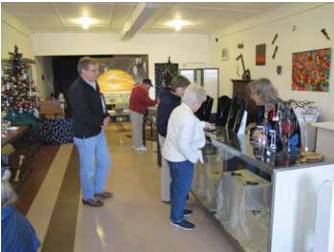
Beach Glass and Stories

pongo and Chatham Vineyards. Owned and operated by the Wehner family, Chatham is hailed as a European-style vineyard. We MGs wondered why no one ever makes a fuss over British wineries. However, we waited patiently outside while our humans spent what must have been an exhausting hour sampling exotic liquid fuels. I say this, because we immediately made our way to Onancock and Mallard's at the Wharf, where they could fortify themselves with lunch.