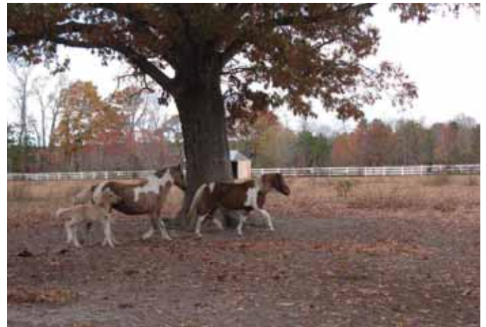
Ponies at Chincoteague

Although the winery was the last “official” stop of the tour, we made a detour on the way out to visit a number of Chincoteague ponies, one of which was an adorable foal. Coincidentally, this was also home of one of the orange roadster's humans. After a short visit and photo taking, we and our humans parted ways for separate trips home. It was, all in all, a crackers good time and one that I will enjoy describing in excruciating detail to Herself this winter.