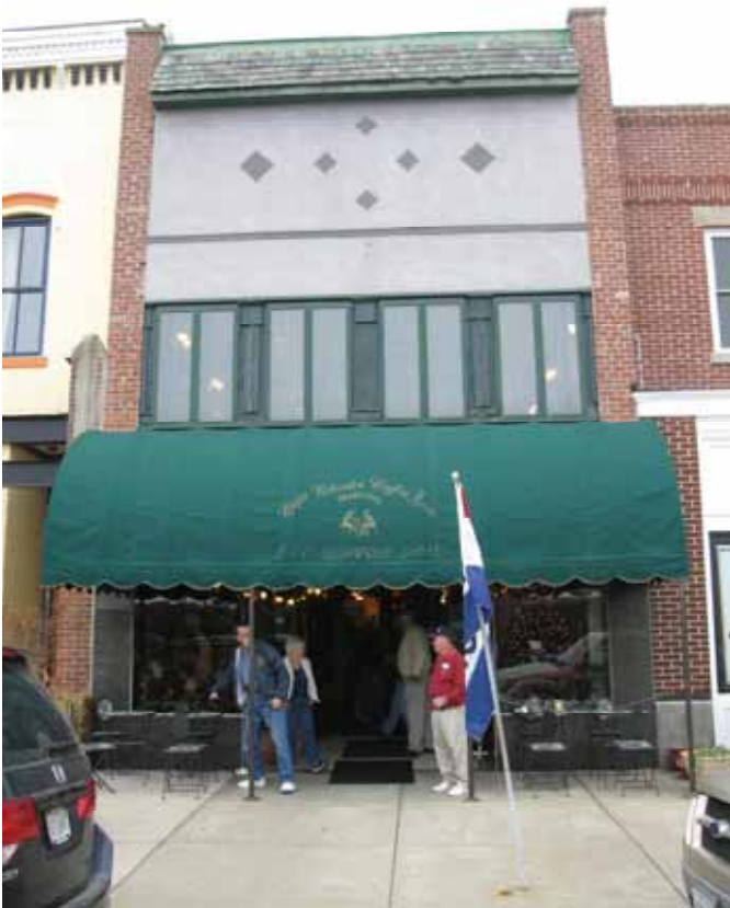
Cape Charles Coffee House