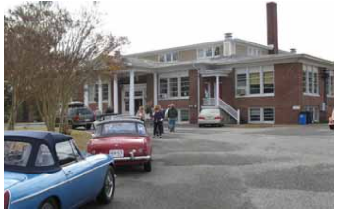
Artisans Guild Studio

Housed in the old Onancock School building, the Artisans Guild Studio provides space for more than a dozen individual workshops set up with artist's wares. Rather suspiciously, more of our humans emerged with bits of solid fuel than items of art. For our part, the MGs provided an impromptu show in the parking lot that drew a good number of admirers.