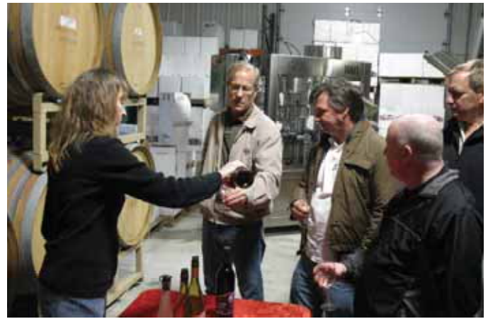
Wine tasting at the winery

Although the winery was the last “official” stop of the tour, we made a detour on the way out to visit a number of Chincoteague ponies, one of which was an adorable foal. Coincidentally, this was also home of one of the orange roadster's humans. After a short visit and photo taking, we and our humans parted ways for separate trips home. It was, all in all, a crackers good time and one that I will enjoy describing in excruciating detail to Herself this winter.