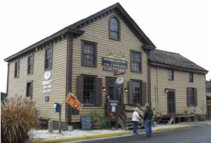
Mallard's at the Wharf

From the noise and a few glimpses though second-floor windows, it was apparent that the restaurant had segregated out humans from the rest of the customers – not all that surprising. We were happy that they