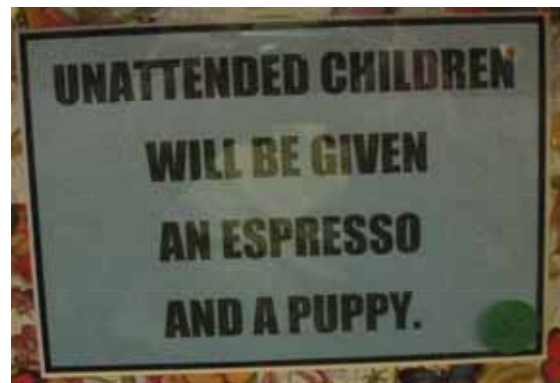
Sign at Coffee House