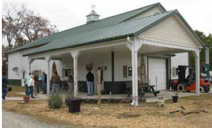
Holly Grove Vineyards

to stand guard – or at least keep the nasty buggers distracted from us with some petting. It was noted amongst the MGs that our humans had purchased more exotic fuels than art objects during the excursion, but they are thankfully a mostly responsible bunch when it comes to our operation.