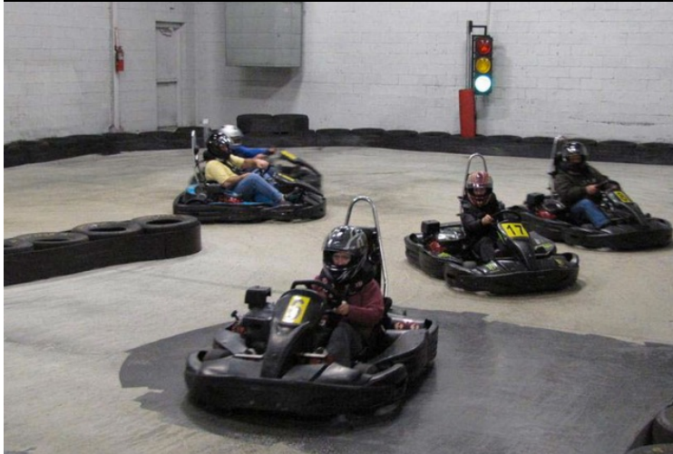
Feb 2011 Mtg. @ American Indoor Karting