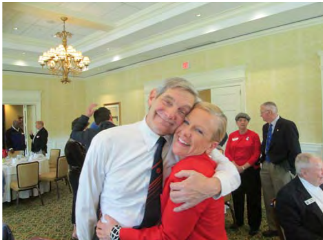
Two TMGC Revelers