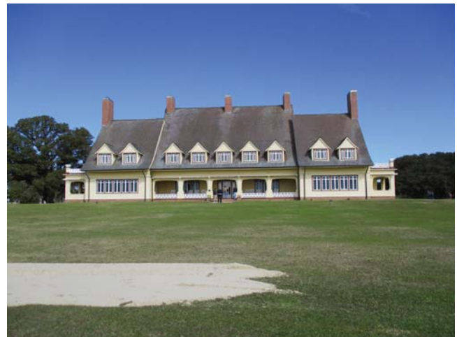
22,000 square feet of elegance