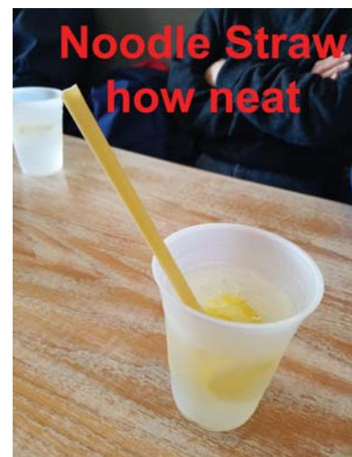
Plastic straw alternative!