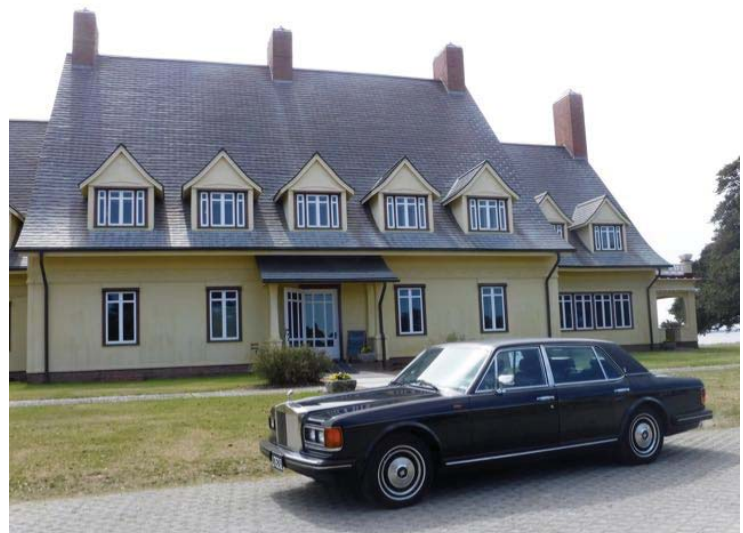
Eric's Rolls feeling right at home