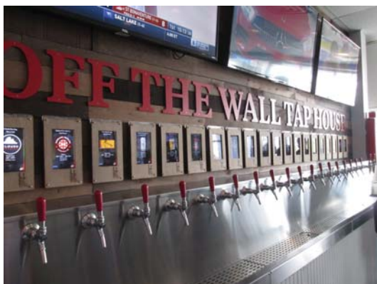
So many taps; so little time!