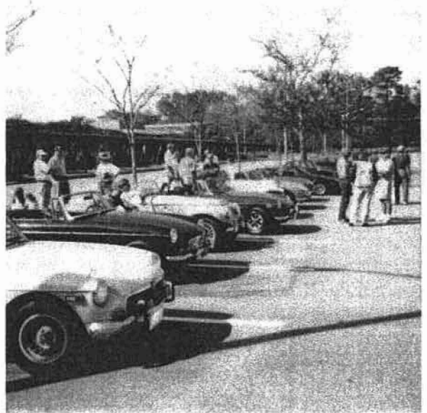
Pig Roast 'Gimmic' Rally

Despite the problems, this was a great trip. Including Richmond and Wings and Wheels, we put 1000 miles on the cars over 3 weekends. I am looking forward to next year!