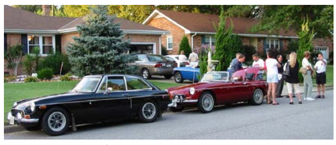
Meeting, August 6

(And in case you were wondering – yes, it included diamonds).