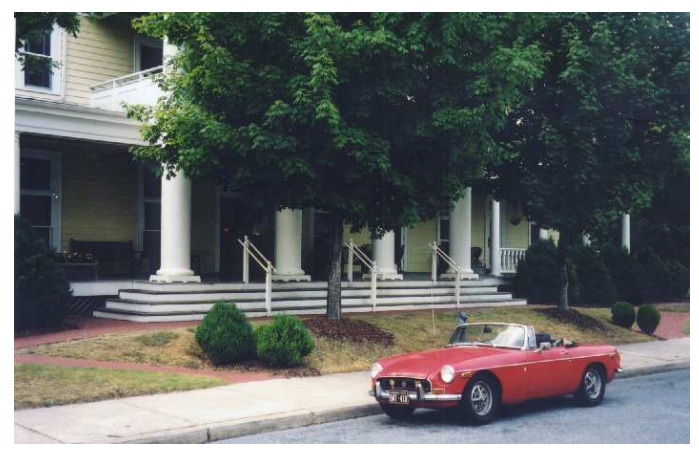
The B in front of the Henry Clay Inn

The destination was a Bed and Breakfast in Ashland, Virginia. The transportation was a '72 – B. The picturesque "Henry Clay Inn" is located at the train station (which still operates regular Amtrack service, lest the MG not "B" willing to do the return trip.) A scenic route from Virginia Beach took them from Route 17 to Route 10, through Smithfield, Surry and on to Chester, Virginia. A short/long stop (depending on who's telling the story) at Herbs of Happy Hill was fascinating/OK. The next day included a drive up to the Windy River Winery for a few samples and a nice view.