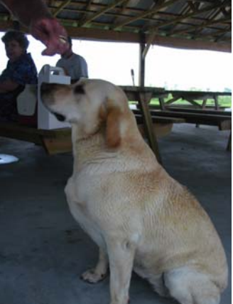
Can't have a winery without a dog!

sooner left than the rain hit again! We could barely see the MG ahead of us; it was raining so hard! I'm not sure who was in that MG, but I can only imagine how it felt to them. The wind was very strong and there was also a lot of hail in it. By the time we got back to the Fentress area the storm had passed and the rest of the trip home was nice.