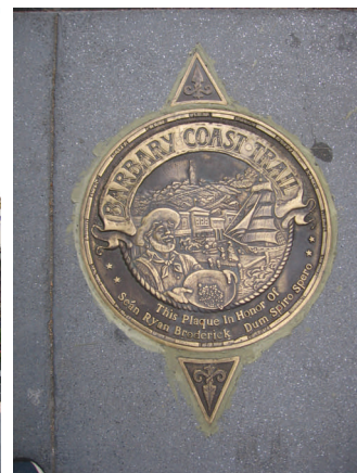
Barbary Coast Plaques