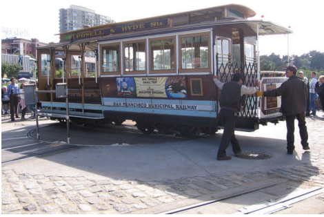
Cable Car on turntable