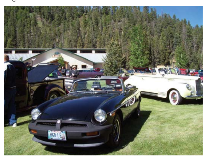
MBG LE with the 1941 Packard "Best in Show".

The awards ceremony was held on Sunday morning at the pavilion on the show field. Trophies were presented to the winners of each class, and $25, $50, $100, and $200 cash prizes totaling $700 were presented using a drawing of entry numbers. There were also a few gift certificates presented, and Becky and I took home a $50 gift certificate from the Red River Gallery of Fine Art. The $25 entry fee turned out to be a good investment.