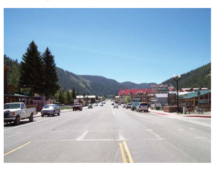
Main Street, Red River, NM

"Red River began in earnest in the 1870s, when miners were drawn in by gold strikes in the area. By 1895, Red River was a booming mining camp, with gold, silver, copper, and molybdenum in some abundance, and a population estimated at three thousand. The mines shut down a few years later and the population waned, but the town survived. By the 1930s the remaining residents turned to tourism as their economic livelihood (from Wikipedia)". http://www.redriver.org/history