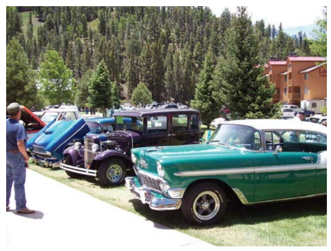
One of the beautiful '55 to '57 Chevy show cars

The show cars were primarily Detroit iron built from the 1920s through the 1980s. The cars sported license plates from New Mexico, Texas, Arizona, Colorado, and one from Virginia (?). The 1955 to 1957 Chevrolet class was the most prominent with about 20 fully restored cars out of the 144 cars in the show. Our 1980 MGB was the only British car, but it did win in the 1980-1989 class. The best in show was a yellow 1941 Packard that was parked next to the MGB LE. The Packard was all original, having spent much of its life in a museum. Voting was difficult, especially with the fifties Chevy's. There were classes for all of the usual categories plus best paint, best chrome, best modified, best kit car, best pickup truck, and best low rider.