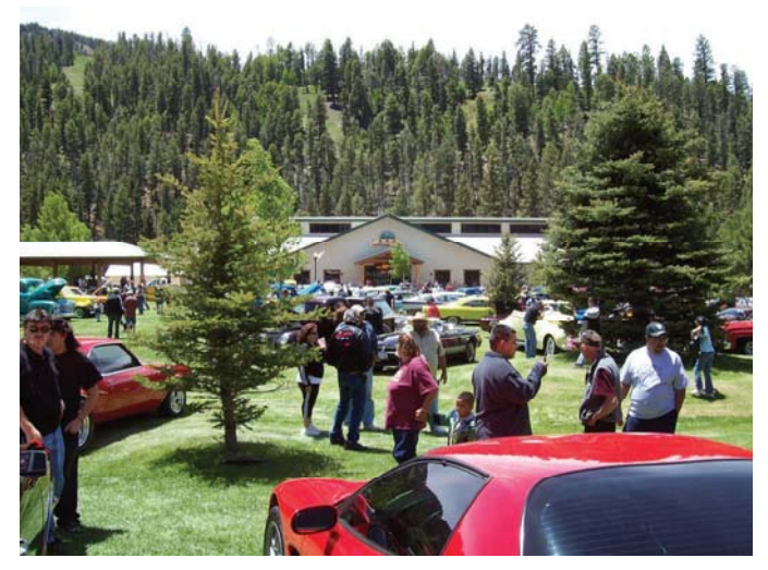
View of the show field with the convention center in the background

emergency medical services. Free hot dogs and sides were provided during Friday evening's registration at Bull'O the Woods Saloon. A free continental breakfast was provided under the pavillion at the show field prior to Saturday's show and Sunday's awards presentations. The goal of the chamber is, of course, to bring visitors to the town who will spend money during this three-day car show. They're very successful.