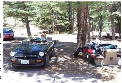
Car cleaning in the Cibola National Forest