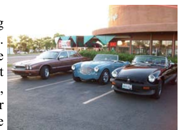
At the Owl Cafe

The club meeting was a great social event. The café dedicated the parking lot at the front door to our British cars, and reserved the outdoor covered veranda for the