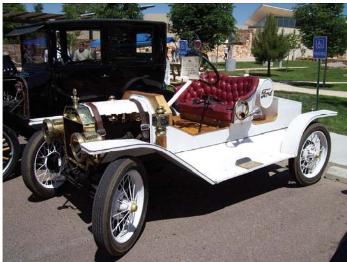
One of the many Model T Fords at the show

The parking lot and all side streets were filled with hundreds of antique cars by 10am. The Model T Ford was the honored marquee, celebrating 100 years of the Model T.