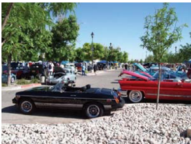
Our MGB LE with a great parking spot