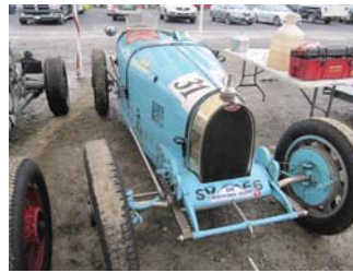
Nice old Bugatti