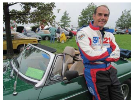
One happy guy