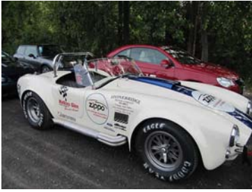
Just one of the great, booming Cobras

tryside and villages, and starting and finishing in downtown Watkins Glen. Now, they warn you orally and in writing that the roads are not closed and all laws are to be obeyed. But, of course, reality is a bit