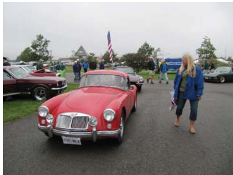
Two beauties from 1959

little early that day because I didn't want to overdo it and we wanted to take a nap and then enjoy another great dinner and evening in town. It was so great, all weekend, to drive around and park in the village of Watkins Glen with vintage cars of every description surrounding you – it was like being in a movie!