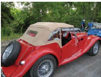
Nice Morgan with navigator clock

New York Finger Lakes region. The scenery, the cool crisp air, the vintage cars, and the girl were all beauti- ful. Picture perfect. I was grinning from ear to ear the