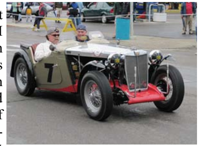
Great MG racer

ergy at these events it reminds me of why I love running with friends. Everyone is interested in each other's stories and sharing their tales of mistakes and successes. It brings out the best in people and the vintage car experience is the same. We had a great dinner at the marina overlooking Seneca Lake (every meal we had the whole weekend was excellent) and eventually went to bed, happily exhausted.