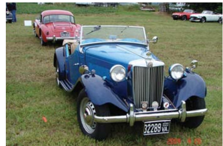
Kate Fisher's '52 MGTD