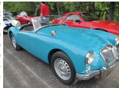
Beautiful blue MGA

and we found we were leading the group most of the time, then we signaled for someone else to take lead if we missed a turn. The sounds of Cobras, Por- sches, Lotuses, Mus- tangs and, of course, lots of great MGs filled my ears and senses. It was great fun having “vintage” be the norm, rather than the exception. In the middle of the rallye we all stopped for lunch at one of the local river falls, gawked at cars and kicked tires, and downed little bottles of champagne Lorin had thought to bring. Perfect!