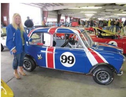
A little ??? (British car!)

Sunday was a spectating day. I was glad I had bought a couple of camp chairs the day before (yes, forgot to bring 'em; now I have two more) and I had been to the Glen a couple of times so knew the