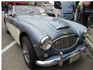
Another classic, the Austin Healey 3000