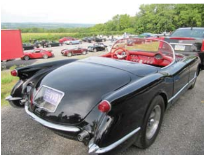
Classic Corvette ('53?)

By late afternoon the road course laps were winding down and we all were allowed to park our cars along the main drag, by virtue of being in the tours. It was a great treat to walk up and down the street and talk to owners and