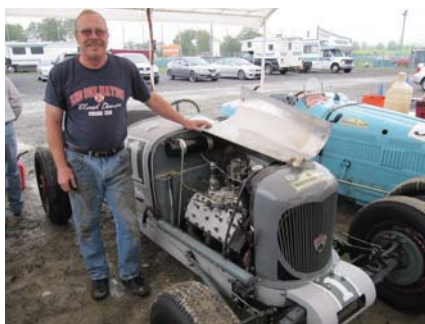
One of the oldest racing sports cars in America; a veteran of original Watkins Glen road races

mounted on the boot and I was set, brother! The race course lap, though not as fast as the open road course