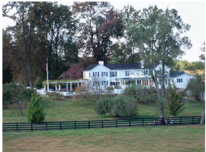
(Rear view of house)

The ride home was magnificent with both the beautiful scenery and, best of all, no traffic jams, but the image that lingered most was the beauty of Willoughby Farm. Although the British cars were some of the best at most of this year's shows, the farm was the highlight of the day. The host, Bill Scott, is a geologist by profession. His fabulous property of 60 acres includes a luxurious home, complete with swimming pool and hot tub, plus an attached 1870s wood-beam two-story cabin. If you've never attended the Hunt Club Classic Car Show, I would recommend that you consider going to it next year.