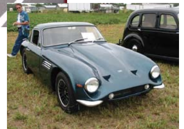
Bob Ross's TVR