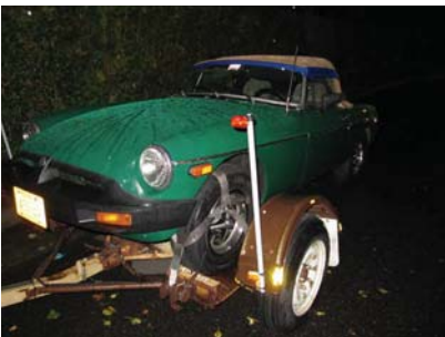
Lashed down, ready for the journey

I got lots of great advice (both ways) on tow dolly usage and decided to disconnect the drive- shaft; marked the shaft so it went back on the same way it came off, and had no trouble towing with my Explorer. I traveled