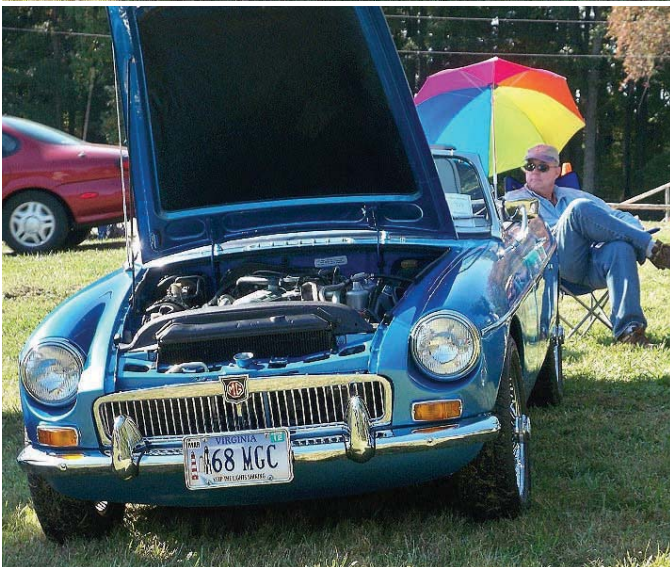
Chuck and Becky took 2nd place