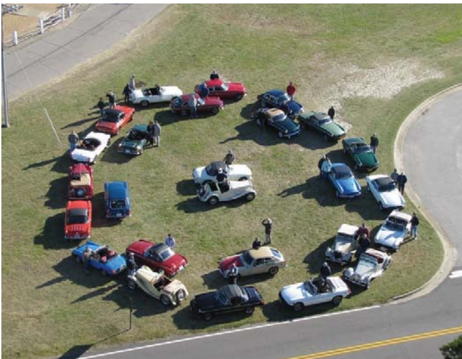
MGs in the Octagon Formation