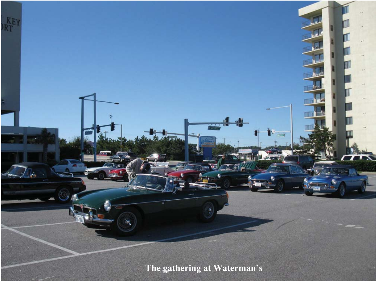
The gathering at Waterman's