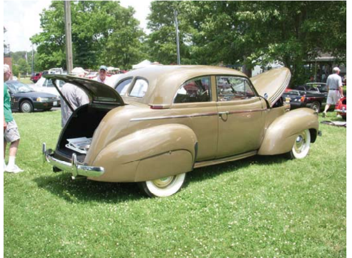
1940 Graham Sedan

The first annual Ascension Cruz-in on Saturday, June 15 at the Church of the Ascension was an outstanding success. Vehicles displayed included old Jags, MGs from a variety of different models and years, muscle cars, and vintage automobiles.