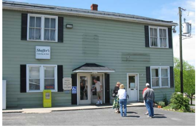
Shaffer's Catering Shenandoah Vineyards was only a short drive from