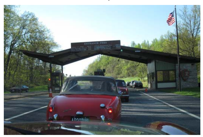
Skyline Drive National Park

-33 to the Skyline Drive National Park where we headed north on the Parkway. With the trees in bud,