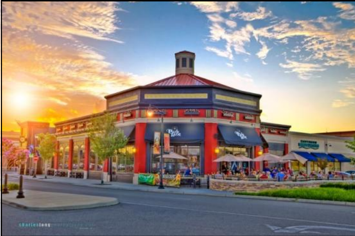
Park Lane Tavern, Hampton—weather shown is not guaranteed.

Park Lane has reserved a portion of the restaurant for our dinner and meeting. To make sure enough room is allocated, please let me know by phone or e-mail if you will be attending.