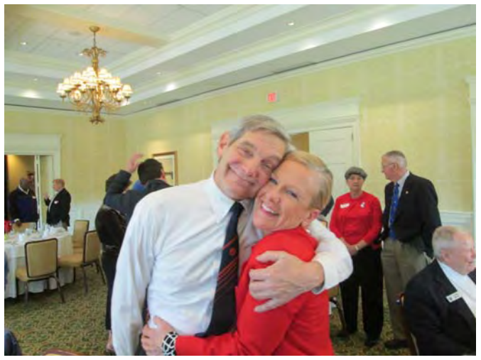
Two TMGC Revelers