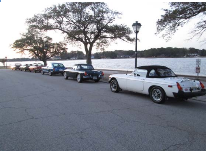
Sunset along the Lafayette River