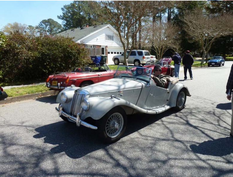
Tech Session Regular Customer – arriving!