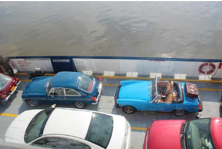
Taking the amphibious route