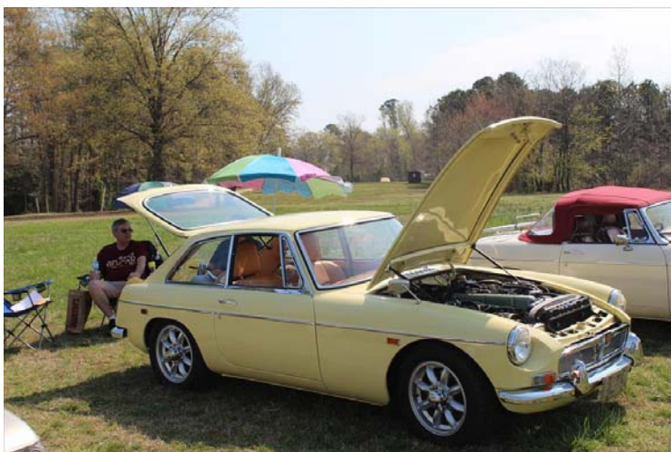
Craig's flawless MGC-GT