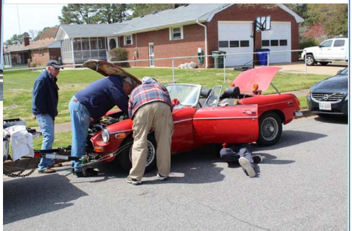
Bringing in reinforcements