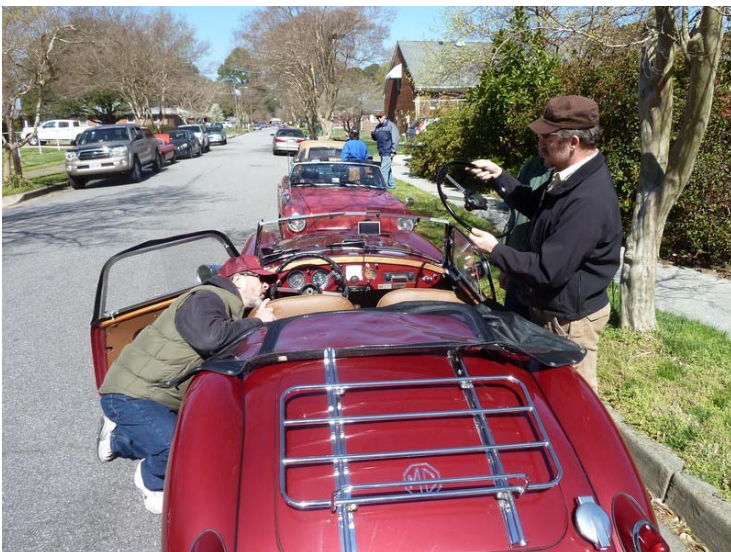
Time to swap steering wheels