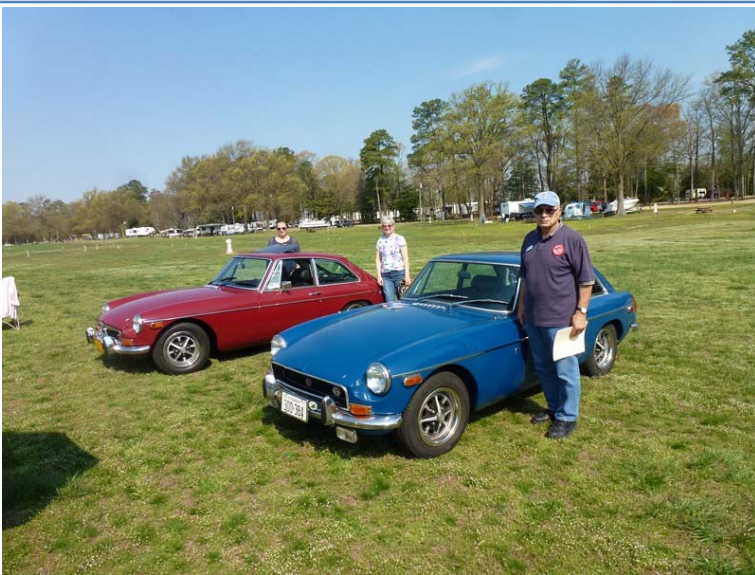
TMGC GTs at Chickahominy

The Dipstick is the official publication of Tidewater MG Classics (TMGC). Our members share their love of British cars with anyone who will listen. For more information, please contact the editors at: (757) 831-4196 or davidoskicrew@cox.net