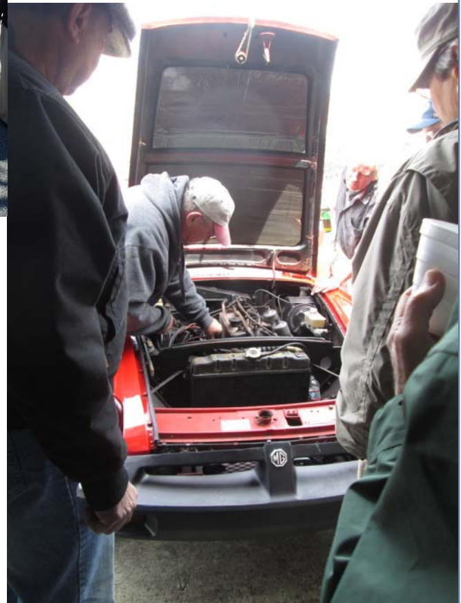
Frank in action