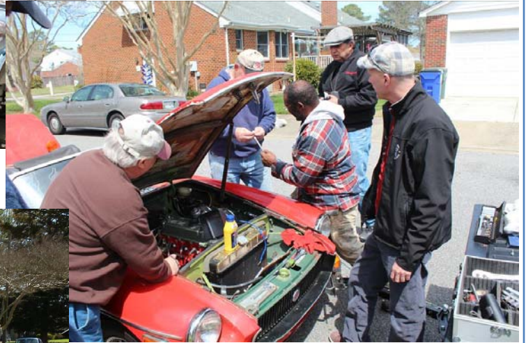
Many hands make light work!