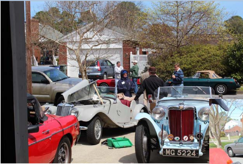
Two B's, two T's, and a Midget