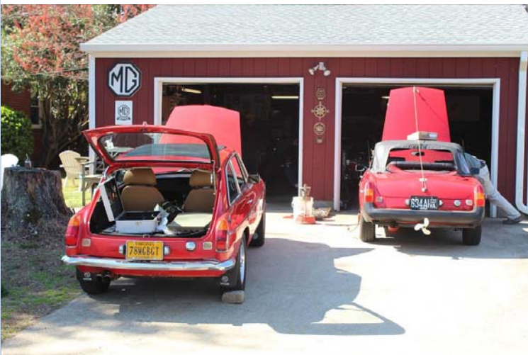
“Study in Red”

The Tech Session turned out to be great for all concerned – we MGs left healthier, while our humans were able to enjoy good company and good fuel.. er food. I hope my human will take me to the next one – someone there might finally fix my radio!