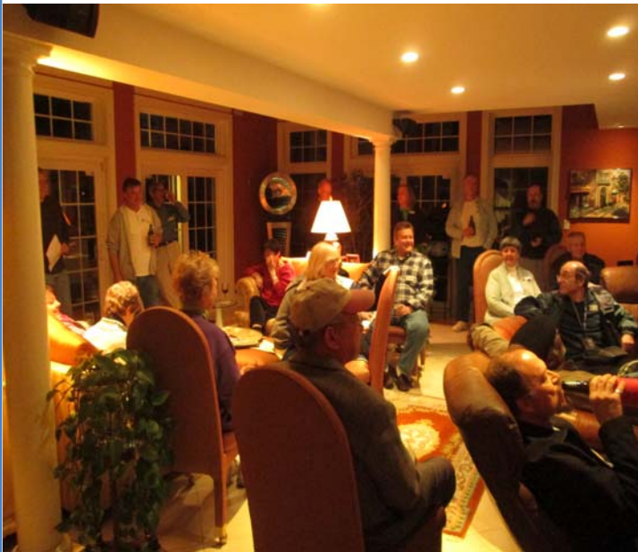
Enjoying that TMGC Meeting Buzz

The meeting was adjourned to Fantastic Food!!!