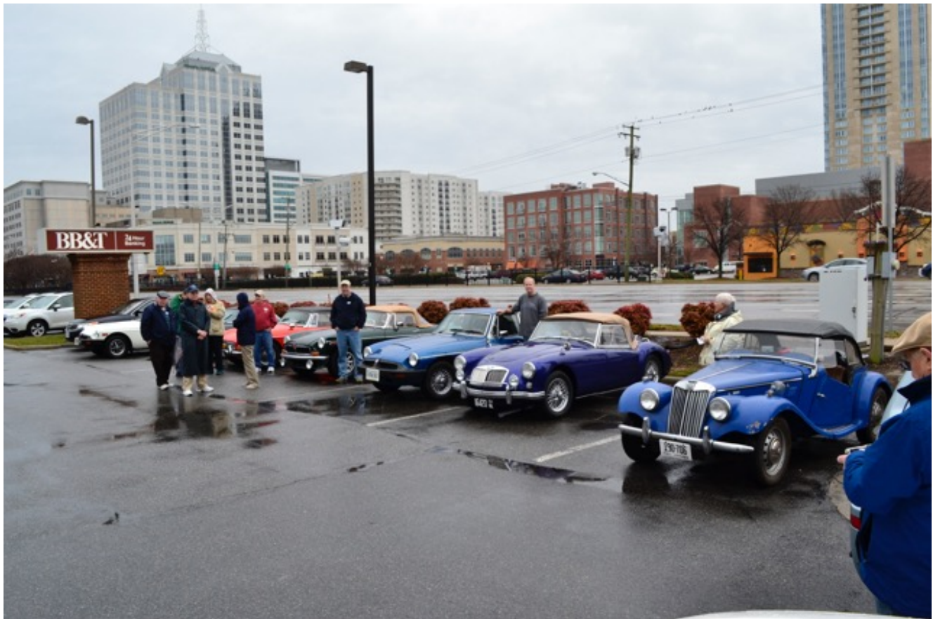
Still living the dream. Same location, March 14, 2015. (Notice that Mike and Jennifer's TF has gone from red to blue!)