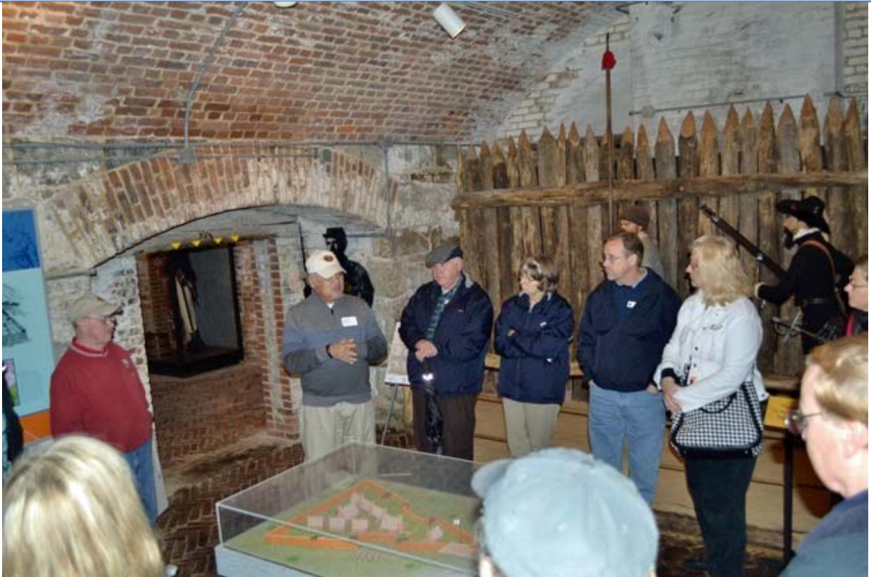
Inside a Casemate