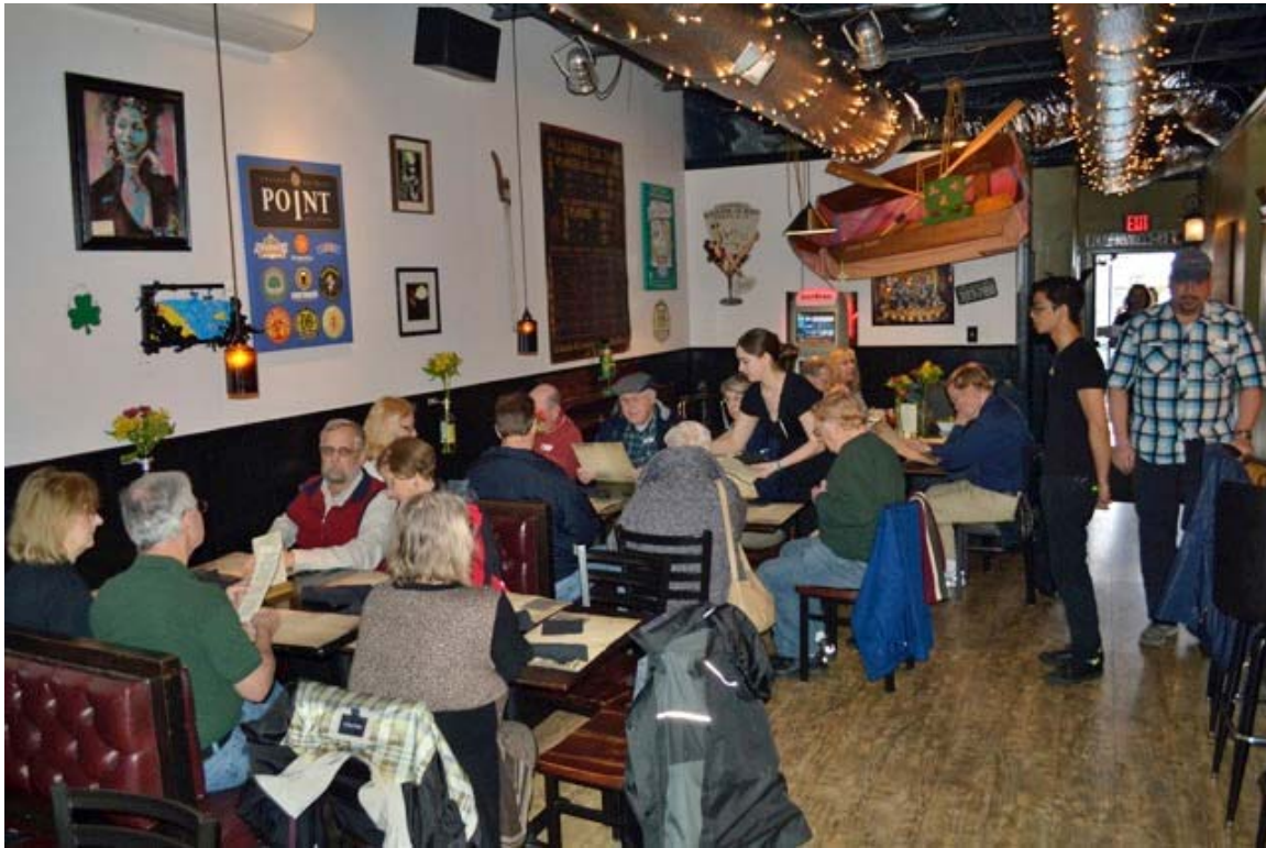
Lunch at The Point