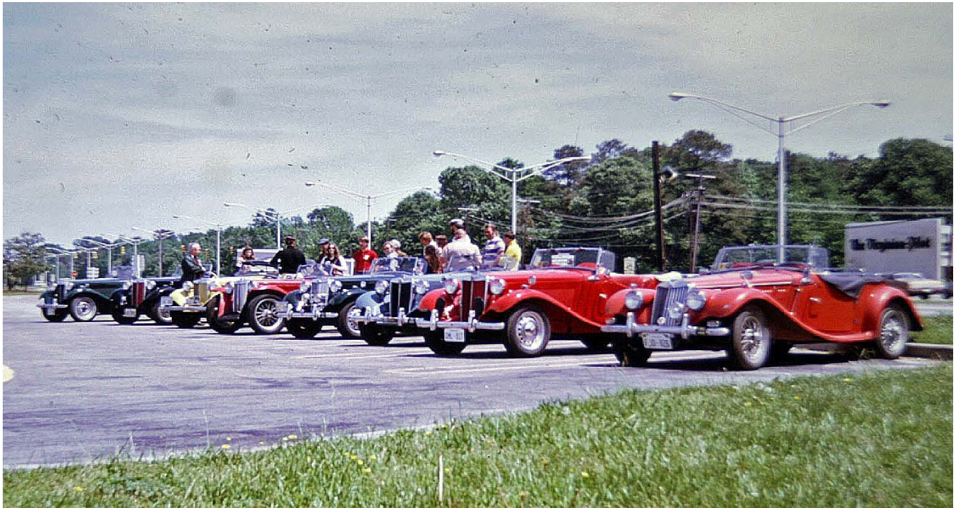
TMGC is born. Corner of Independence and Virginia Beach Blvd, 1973.