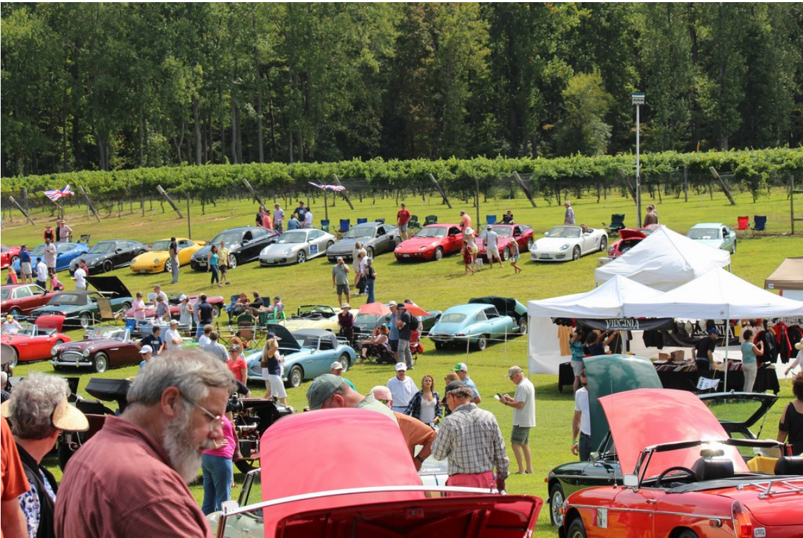
MGBs, Big Healeys, Jaguars, and Porsches at New Kent