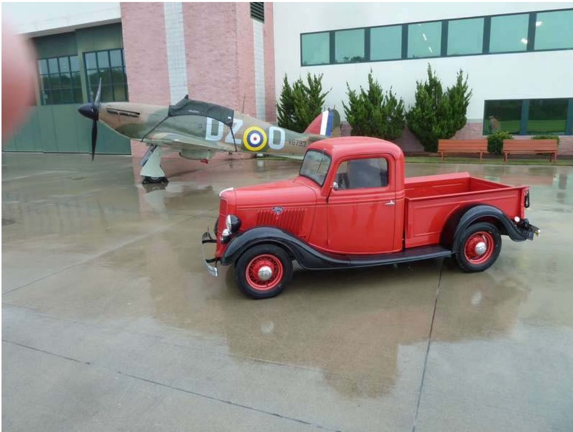
Best in Show at Wings & Wheels 2015 – 1935 Ford pickup with Hawker Hurricane