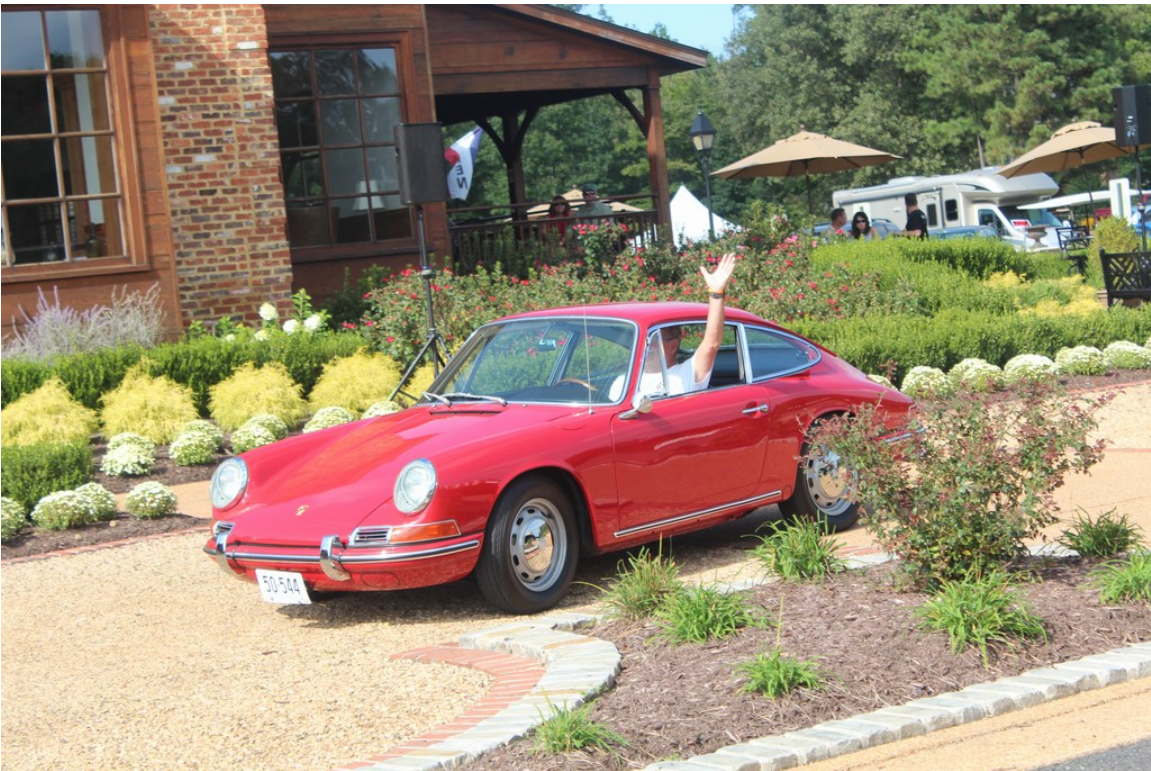
Jim Villers in the New Kent Winner's Circle