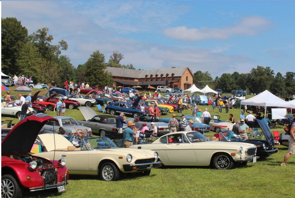
New Kent Winery forms the backdrop