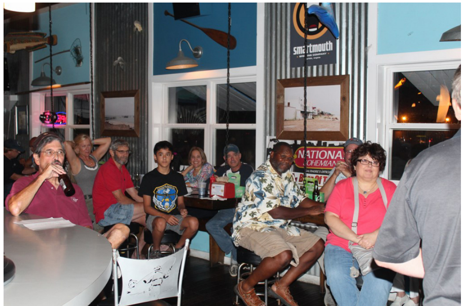
Good times at Ocean View Pier!