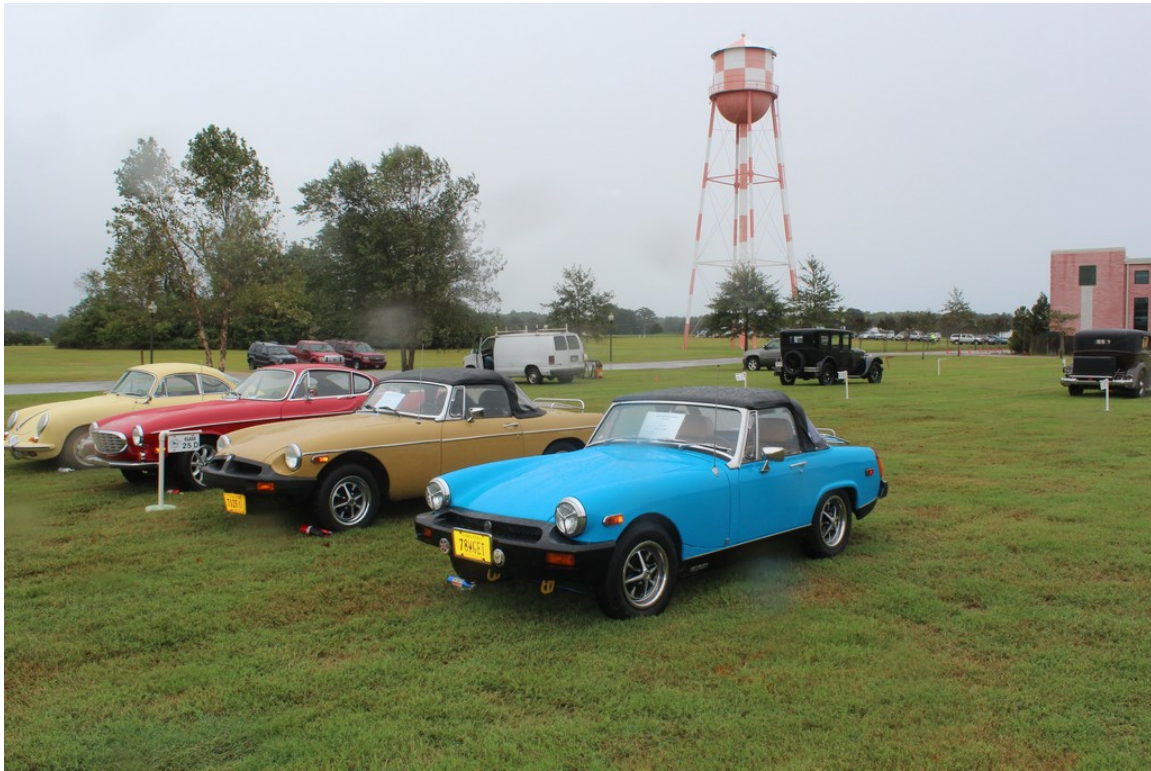
Damp Classics at Wings & Wheels