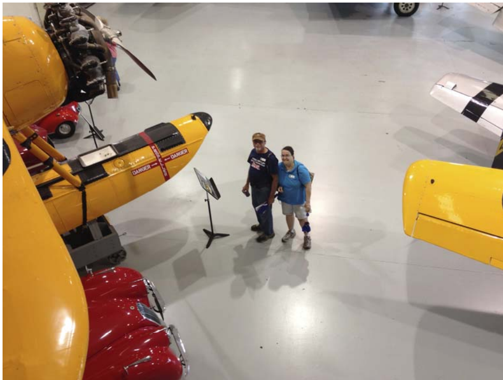
Rose and Donald doing some hangar flying