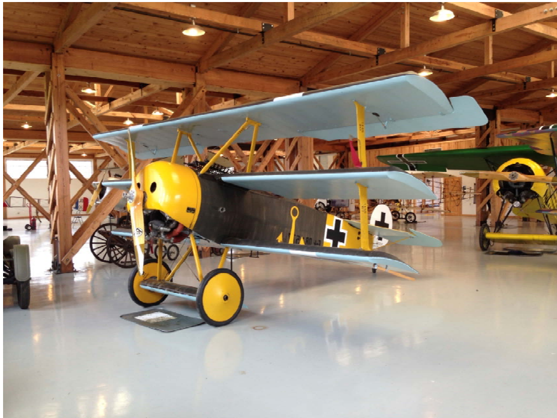
1917 Fokker Dr-I replica in flying condition confdcondition