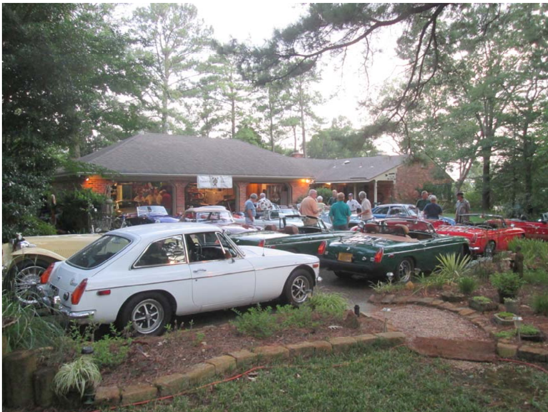
Packing in the MGs at Villers' Garage