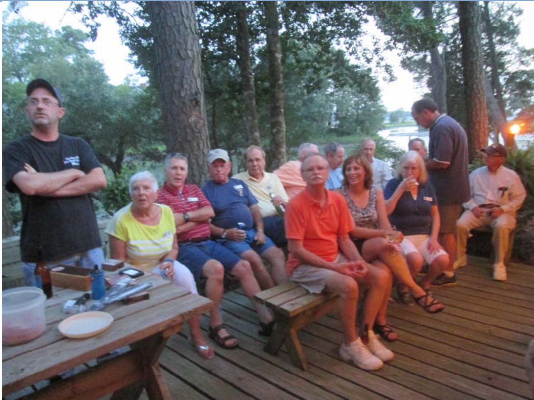
Attentive, well-behaved audience