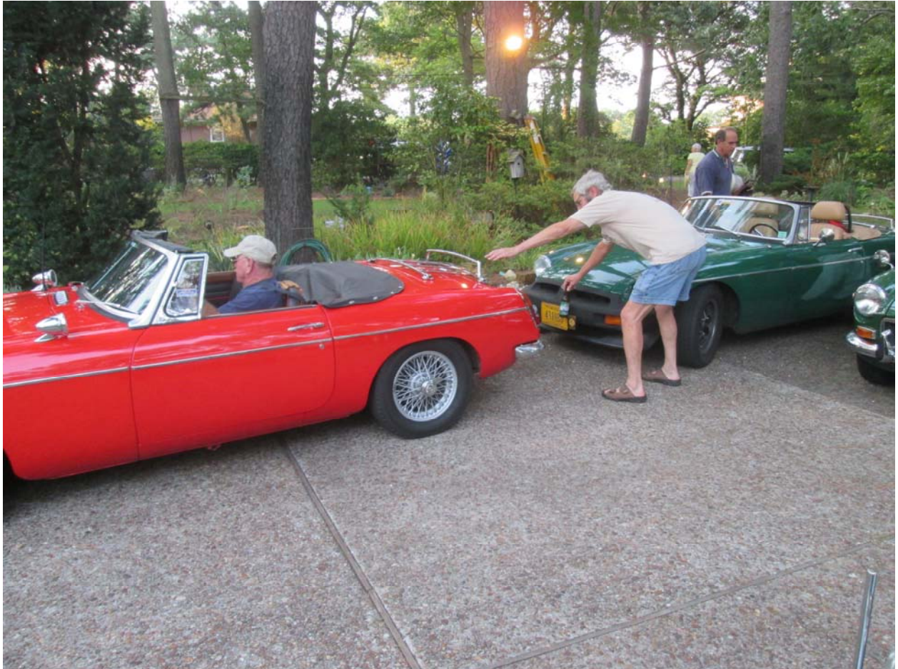
TMGC lot attendant hard at work