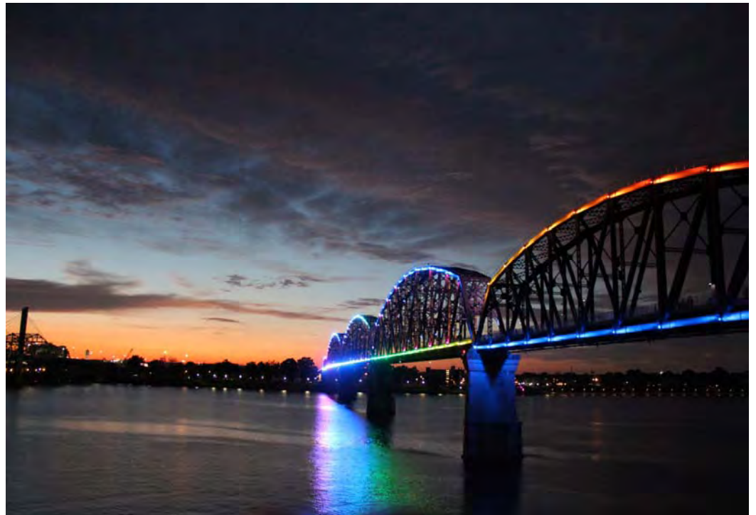
Looking northward toward Indiana – Union held territory