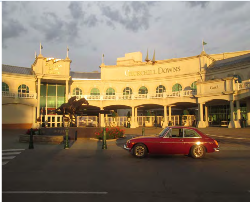
Churchill Downs and Barbero's gravesite