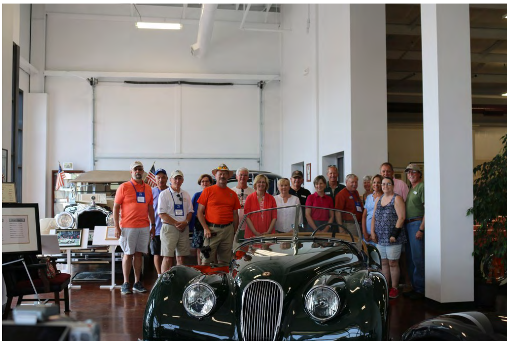
Swope Cars of Yesteryear Museum

Thursday was the big event -- the All Register MG 2016 Show at Riverside Park, on the Ohio River. Over 800 MGs graced a huge expanse of Kentucky bluegrass, with an elevated Interstate highway providing ample shade down the middle of the show field. An extensive sound system piped British rock & roll music throughout the showfield. During the four hours of display time, several of the group wandered into town and enjoyed such things as the Louisville Slugger Factory tour and the many inviting watering holes along Louisville's Distiller's Row.