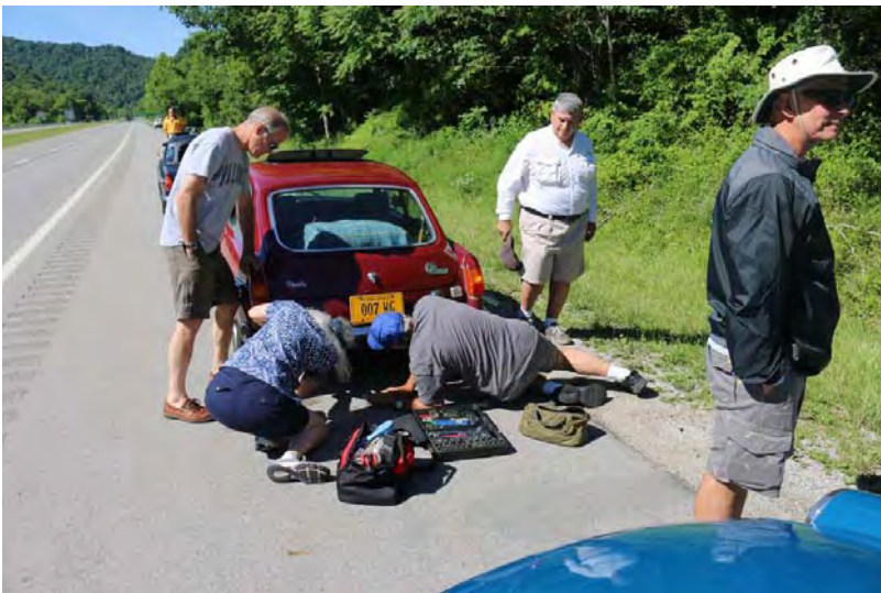
Exhaust pipe adjustments on US 119 South., near Big Ugly Creek Road.

of our toasty cars in the hotel parking lot, Tad, Mark and Donald were each seen to down a frosty pint of Bud Light in record time. (Karen opted for a quickly chilled slug of wine.)