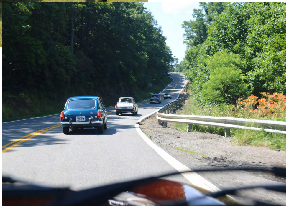
Random views of Kentucky