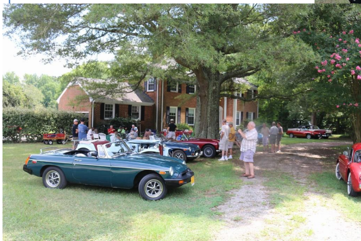
Solving the world’s problems at the August Tech Session