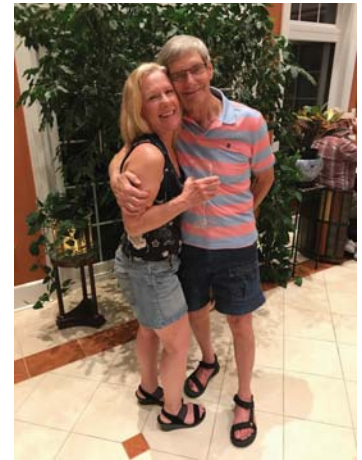
Our gracious hosts!