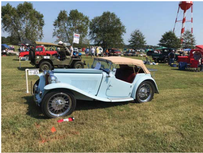
The Bonds' award-winning TC as displayed by Terry at Wings & Wheels 2018