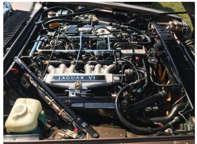
Jaguar XJS engine compartment – a bit more complex than your usual LBC