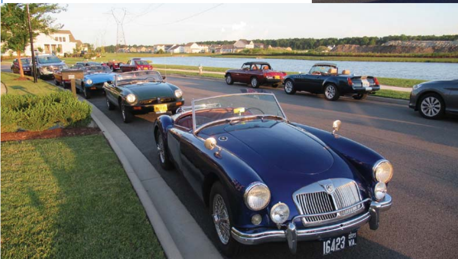
Red, white and blue LBCs