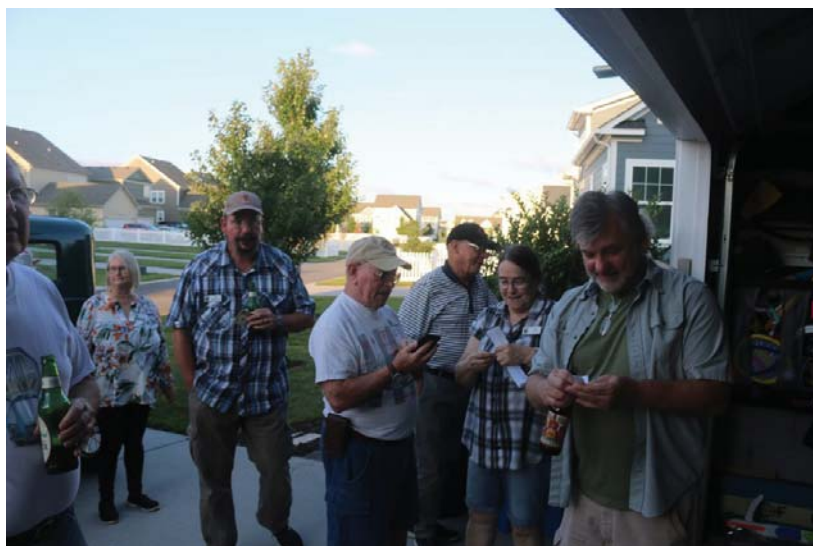
12 meetings like this for just 20 bucks - such a deal!!

Sure, life is complicated for all of us, what with Mueller's testimony, changes in vaping laws, streaming all of those Entertainment Tonight re-runs, and paying those HUGE personal property tax bills generated by our sweet MGs. But seriously folks, to have only 25% of the active (??) membership step up to contribute their $20 annual dues this late in the year....confusing, to say the least. Please heed Andy's plea as stated above and GET WITH THE PROGRAM!