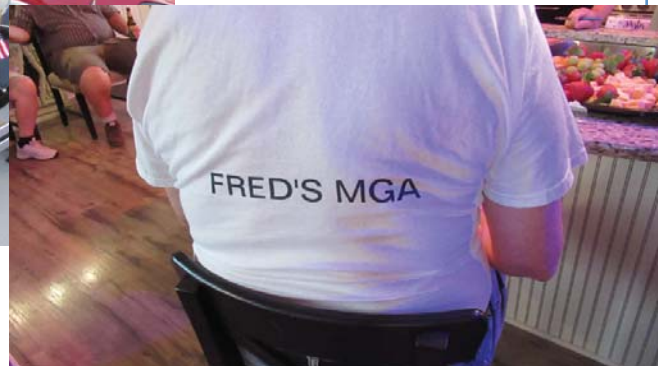
Sharp dressed man!