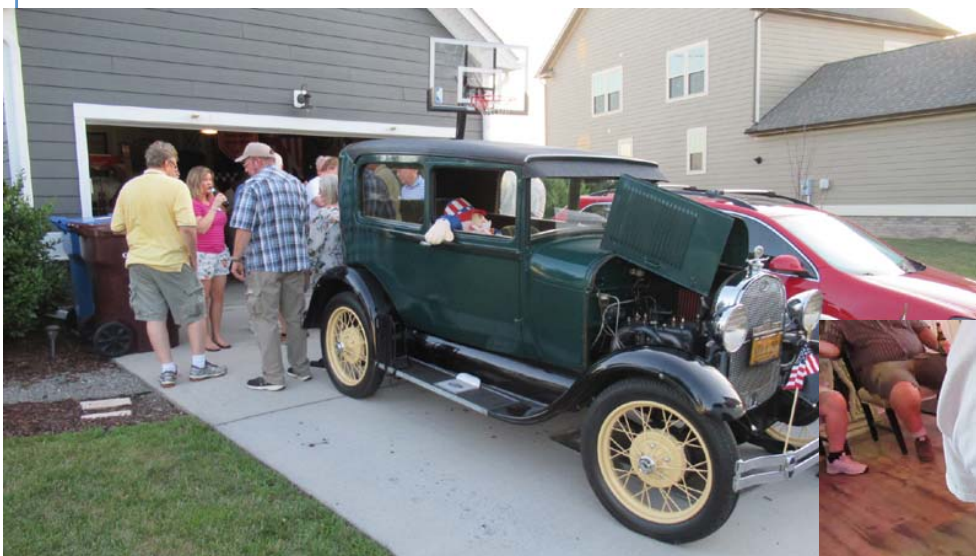
Billy's awesome Model A

There were several motions to adjourn, seconded by most of the assembled crowd. Thank you for putting up with your sub-par, sub-Secretary. Once again, back to you