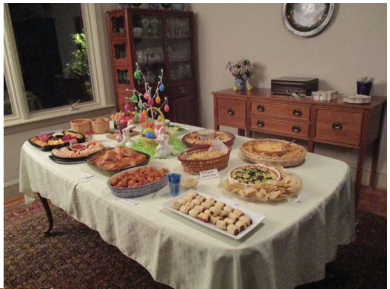
Betty's Buffet : before the assembled horde descended upon it!