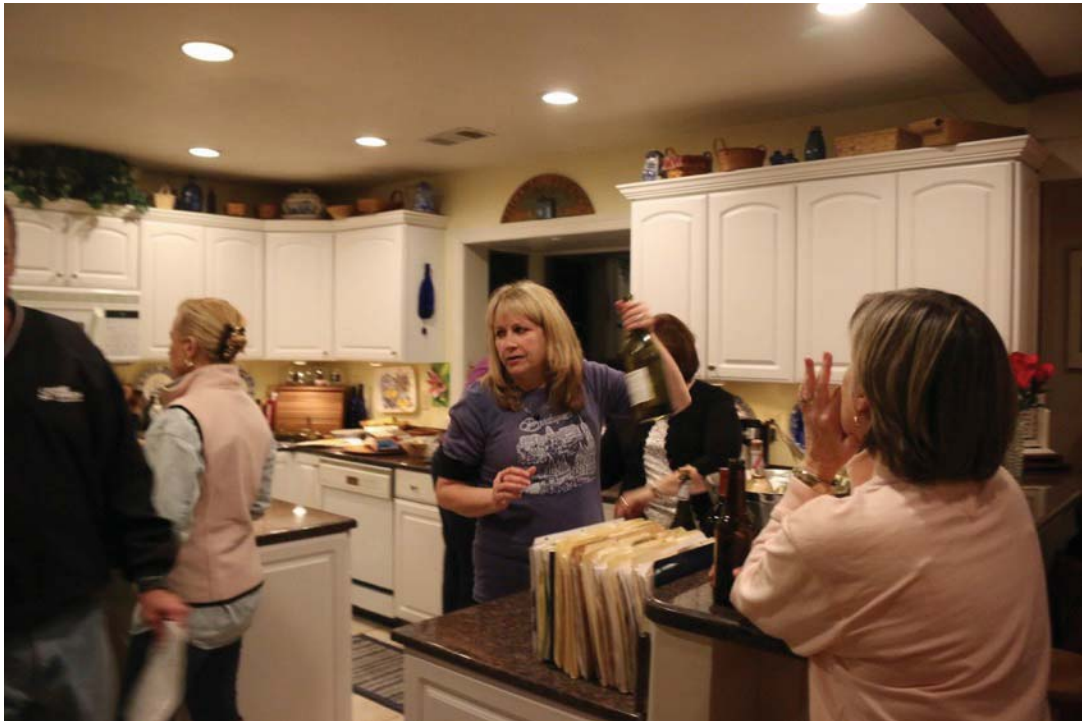
Talkin' in the kitchen with wine in hand – ditto!