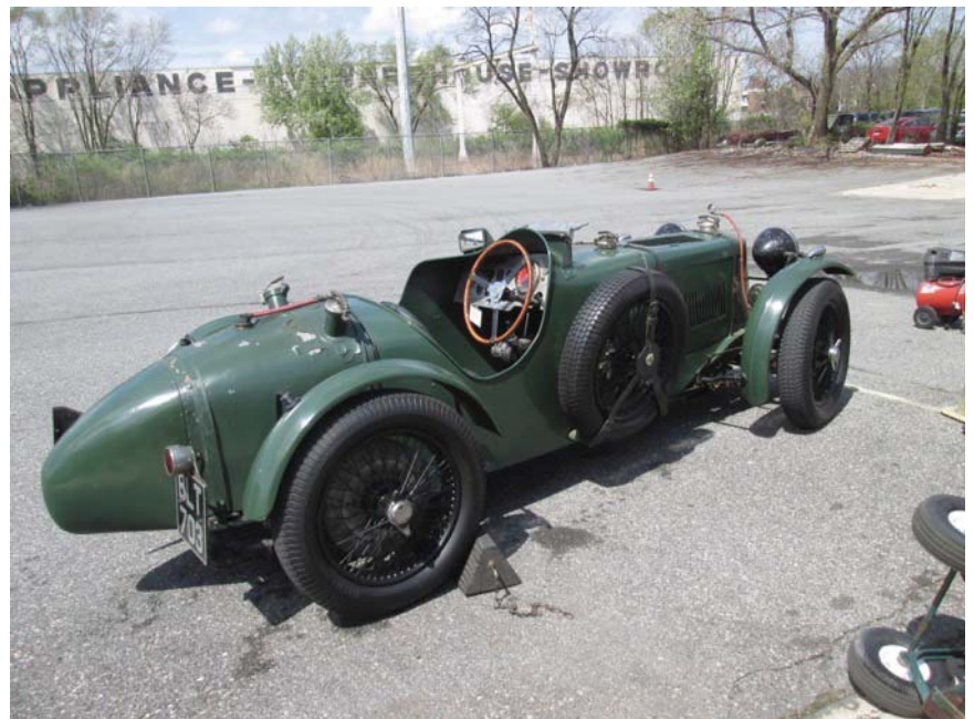
MG K Magnette – 85 years young!

Susan stuck gold in the small flea market and added several great MG models to her collection. Lots of literature and some early parts were available also. Alas, no rare spark plugs were available for me, but we had a wonderful chance to browse and learn.