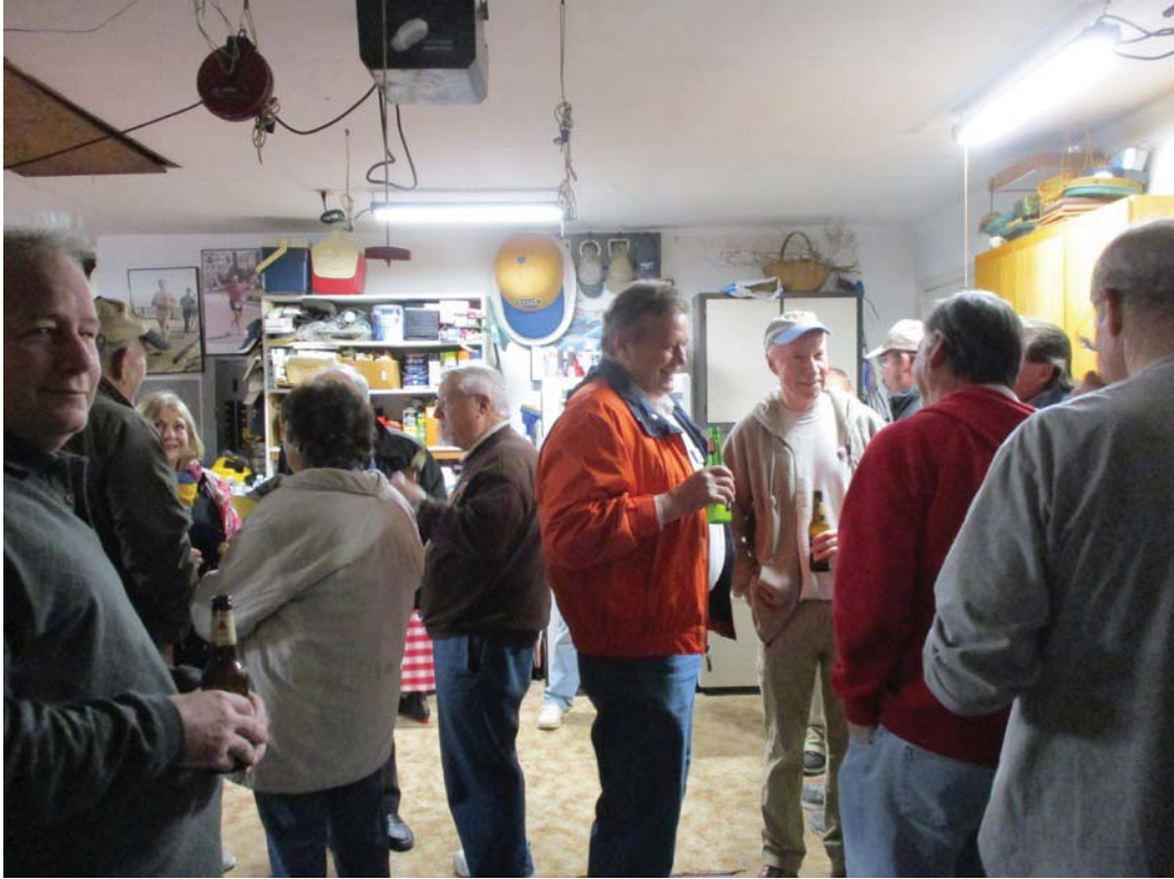
Talkin' MGs with a beer in hand – can things get any better?