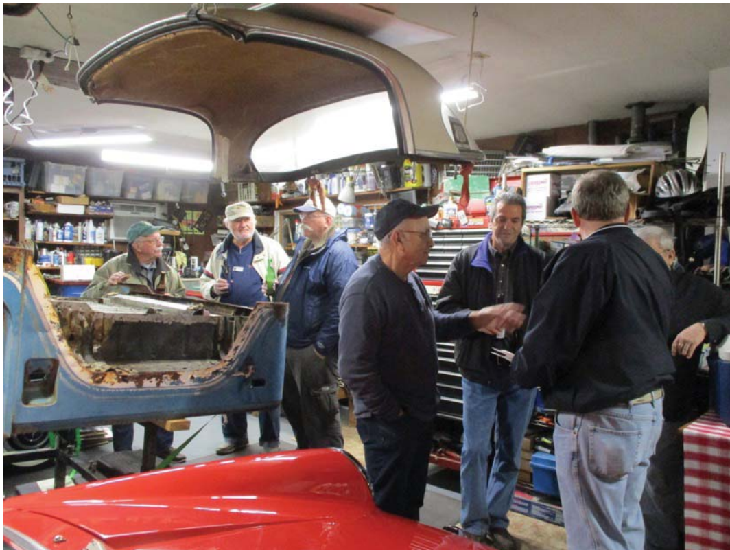
Chewing the fat in Jim’s well-equipped garage

The following evening, we’ll meet at the Harris Teeter on Nimmo Parkway at Princess Anne in Virginia Beach. Again, we’ll shoot for a 6:30pm departure, and again, we have a new destination in mind.