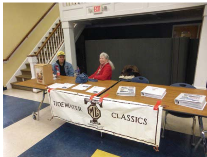
Working our table at the recent TRAACA swap met