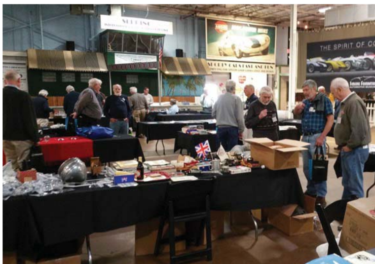
Kimber Festival Flea Market