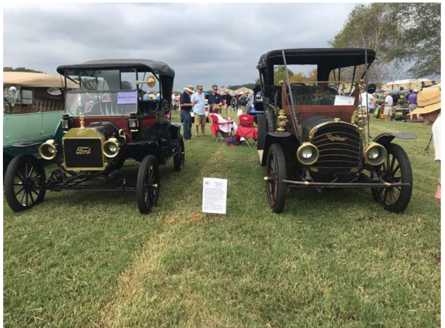
Terry's 1914 Model T beside the oldest car on site: the 1909 Rambler