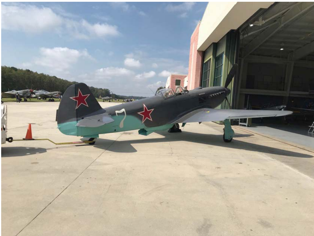
Soviet Yak-3: What a flight demo!

The Aircraft Museum had three of its residents in the air throughout the show, including the Navy N3N biplane and a Piper Pawnee banner tug. One of the banners was a marriage proposal delivered to a show attendee. The highlight of the aerial portion of Wings & Wheels was the demonstration of the Soviet Yak-3 fighter, examples of which saw service in WWII and the Korean Conflict.