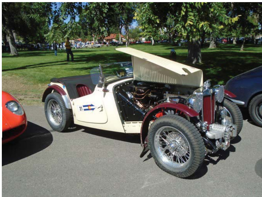
The 1937 supercharged MG TA Roadster with special motorcycle tires/wheels