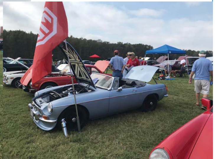
Just one of Billy's trophy winners