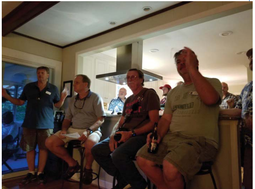
El Presidente holding forth!