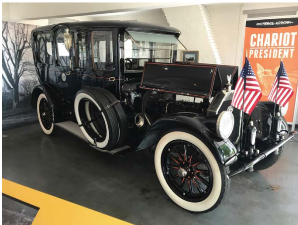
1919 Pierce Arrow Series 51