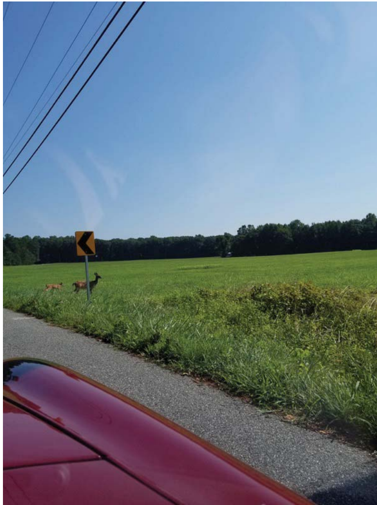
Mother and child "somewhere in Virginia"