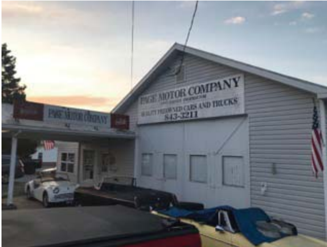
1961 TR-3A with some MGBs

During a recent jaunt through the Luray, Virginia area, a roving Dipstick correspondent encountered some interesting cars. Included were a surprising number of LBCs scattered all over Page County. An added bonus was an up close look at President Wilson's 1919 Pierce-Arrow limousine, which lives at the Wilson birthplace in Staunton.