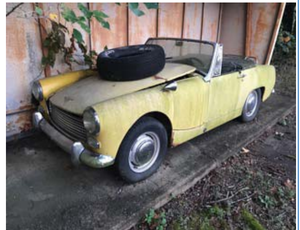
1966 (?) Sprite