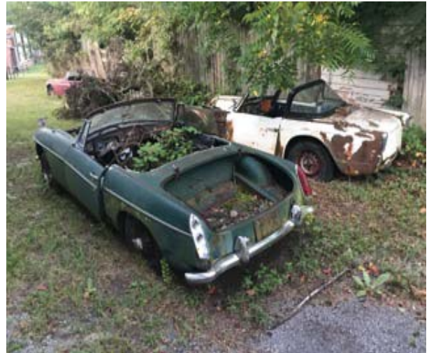
Early MGB and a 1964 TR-4 Surrey Top