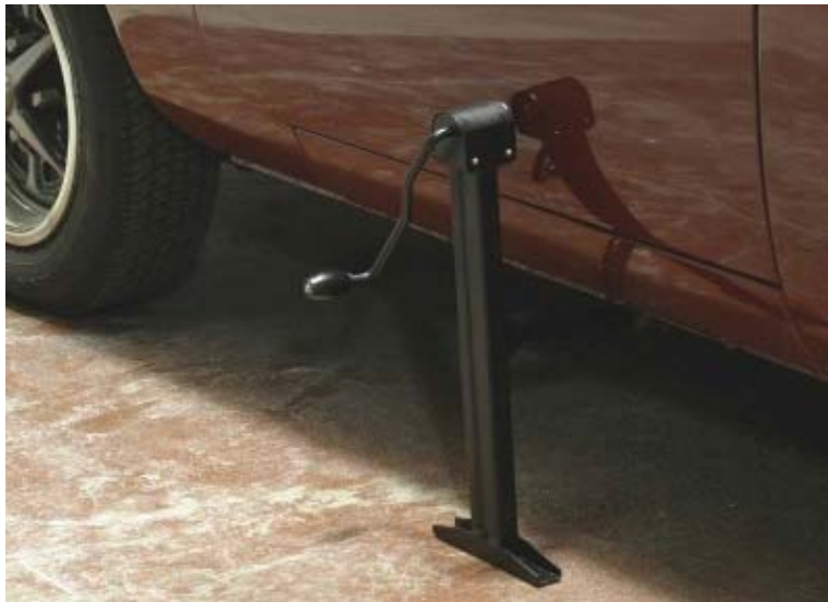
Factory MGB jack in position to lift the side of the car

I do not trust those jacking points nor the scary looking jack that is supposed to be used in them. Most others would advise just displaying the original jack rather than using it. As you can see in the below photo, if anything slips, it becomes a literal “can-opener” and your door and sill become its victims. In a recent informal survey taken by a large antique automobile club, they attempted to identify the ten most dangerous jacks ever supplied with new cars. As you might imagine, the MGB jack was certainly in the top ten!