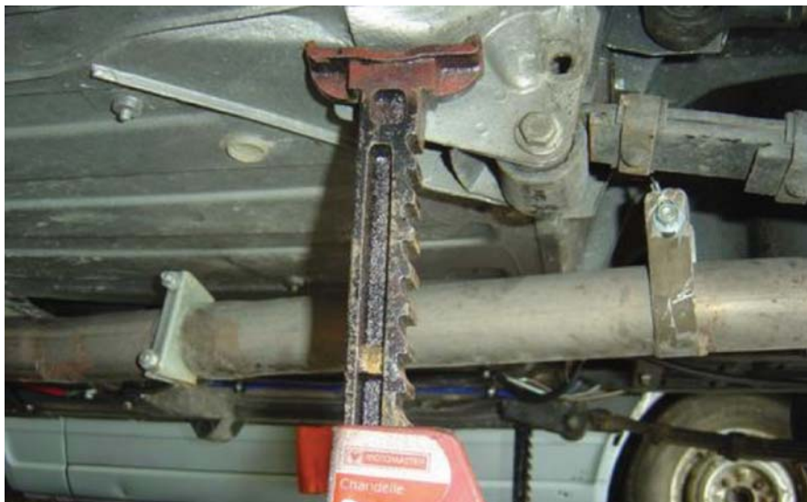
Recommended jackstand placement -- rear

So, certainly use the diff to jack up the car, but put the jack stands under the front of the rear axle spring shackle assembly. This will allow that rear diff assembly to "sag" when you take the weight off that rear axle when you lower the jack. The body/frame of the car now rests safely on those jack stands (unless they are the recently recalled Harbor Freight type). Voila-there is plenty of room to remove the wheels and reinstall.