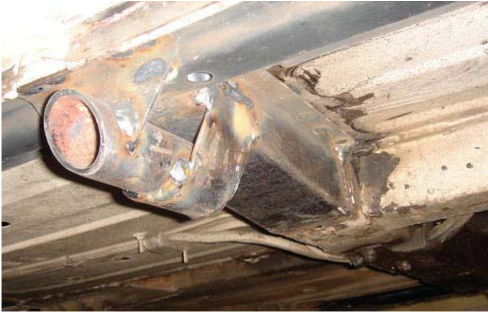
MGB side jacking point

I do not trust those jacking points nor the scary looking jack that is supposed to be used in them. Most others would advise just displaying the original jack rather than using it. As you can see in the below photo, if anything slips, it becomes a literal “can-opener” and your door and sill become its victims. In a recent informal survey taken by a large antique automobile club, they attempted to identify the ten most dangerous jacks ever supplied with new cars. As you might imagine, the MGB jack was certainly in the top ten!