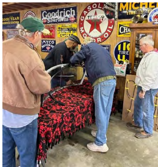
Installing a windshield in the frame.