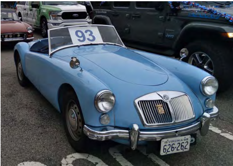
Rob MacPherson 's car in the line-up

For the first time, our club participated in this year's Tidewater Veterans Day Parade in Virginia Beach under cloudy, cool, and breezy weather but no rain. We were supposed to be in last year's parade but it was canceled due to the threat of some nasty weather. Six members showed up at our meeting point on 11 th Street. The cars were then soon aligned on Atlantic Avenue to wait our turn. And wait we did, kicking tires in the cool breeze off the ocean for about 40 minutes.