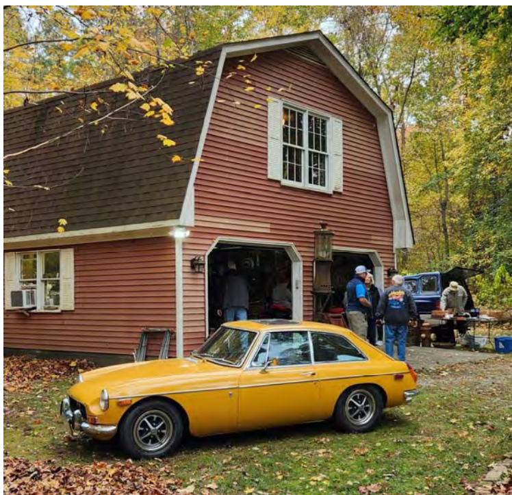
A beautiful fall picture of Hank's MG with the barn