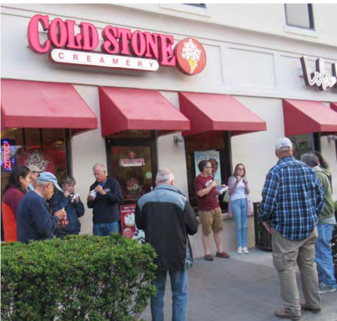
Red Mill Cold Stone Creamery