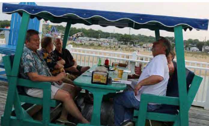
Members on the fishing pier swing