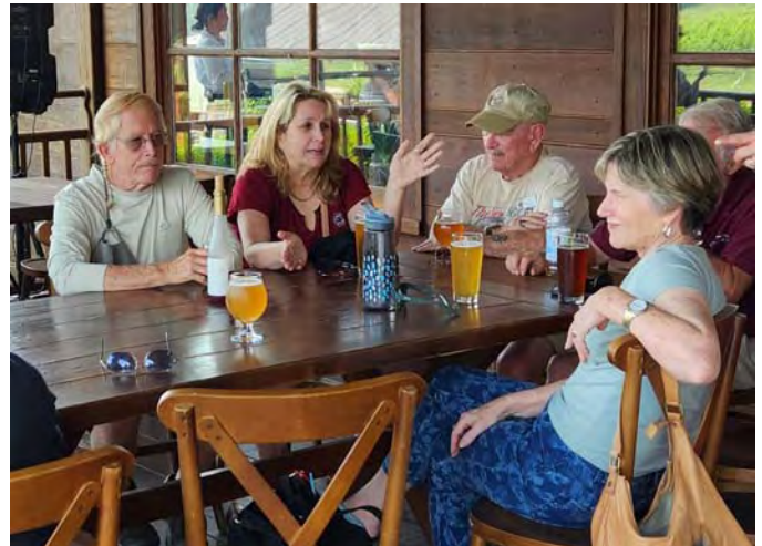
Members enjoying the brew at the New Kent Winery/Talleysville Brewery

At 1:30 p.m. it was time for departure for our next destination: New Kent Winery and Brewery just a short drive away. New Kent’s addition of craft beers to its formerly