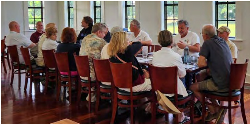
Lunch at the Upper Shirley Vineyards

Passing the iconic “Bubba’s Chikin ‘n Thangs” in beautiful Burrowsville, we knew we were far from the madding crowds of inbound tourists and familiar chokepoints like the Hampton Roads Bridge Tunnel – all good! Crossing the Benjamin Harrison Bridge we soon found ourselves approaching Shirley Plantation. A quick right turn brought us to Upper Shirley Vineyards (USV) for an 1130