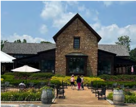
The New Kent Winery/Talleysville Brewery

“wine only” fare was warmly received by many of our group, as well as a large number of other enthusiastic customers. Our lineup of nine MGs drew lots of attention, including a red wannabe LBC; a Pontiac Solstice that completed our display of mostly roadsters.