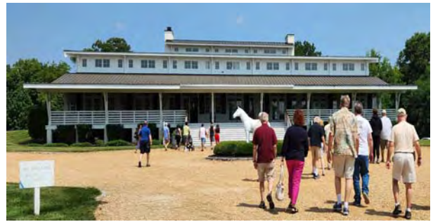
The Upper Shirley Vineyards lunch stop

The formation of seven MGs and one Chrysler Pacifica headed out toward Smithfield and the wide-open spaces northwest of Tidewater. But first we passed two HUGE Amazon Fulfillment Centers (ORF 2 and ORF 3) en-route to the Burger King just outside of Smithfield in order to retrieve our leaders, the Easley's. With a full complement of eight MGs plus the Pacifica, we continued into downtown Smithfield to show off our LBCs. Then it was up VA Route 10 past Bacon's Castle, through Surry and up to Hopewell. The road was pleasantly free of traffic as we wended our way through cornfields and enjoyed the shady side of the road for miles.