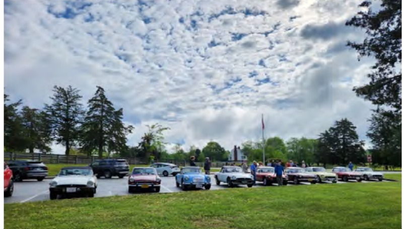
MGs in the parking lot at Appomattox. Notice the sky and storm clouds!

We slept in a bit Sunday morning, then enjoyed a breakfast together while watching TV weather reports in the hotel breakfast room. Of course the top-up or top-down debate began immediately, with most deciding to drive in typical MG fashion with the wind blowing through their hair. We just popped open our sun-roof on our GT, ready for what was almost certain to be a nasty band of rain headed our way.