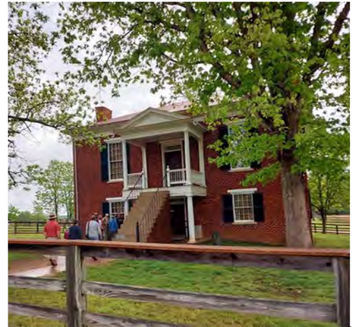
The Wilmer McLean home

After we were educated, we walked over to the home of Wilmer McLean. It was the actual site of the surrender. If you know your Civil War history, you will realize Wilmer McLean was