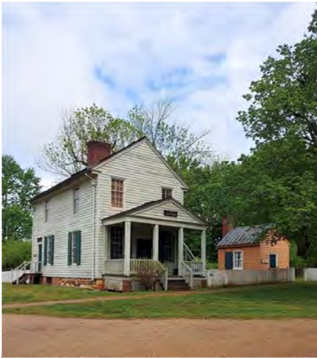
The Meeks General Store at Appomattox Court House.

secured, of course, behind glass windows. It was extremely well done and gave you the feeling of stepping back in time. Of course you know my fondness for old stores. Although there were no antique auto parts in this one, it was still fantastic.