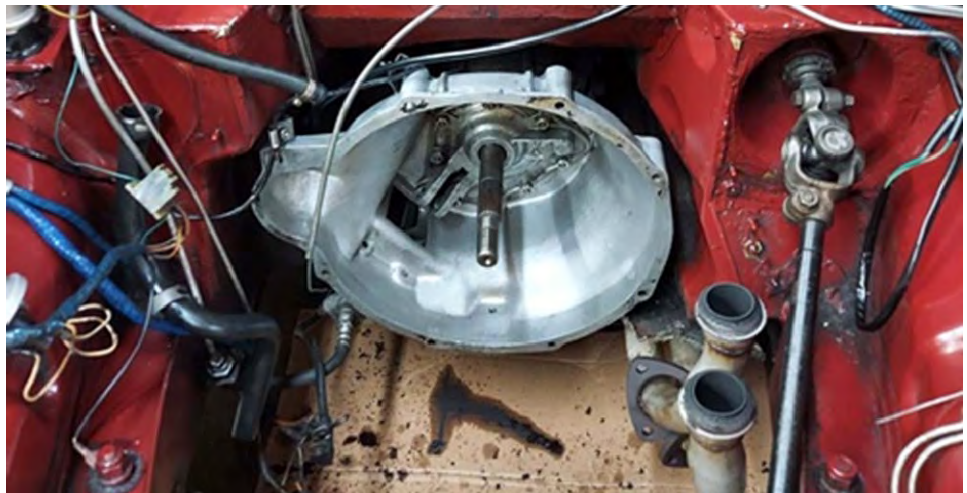
Note the cardboard floor covering. Handy to keep the floor clean and retrieve dropped stuff.

Cars can make a mess! Dirt, grease, oil, and road crap will end up all over. Keep several large pieces of cardboard handy. Slide them under the car in the area you are working on.