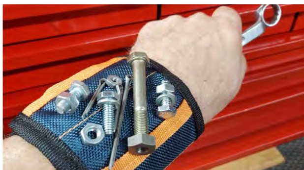
The Magnetic Velcro fastened wrist band. Things will always be handy!

They make clean up a lot easier. Just slide them out and replace with fresh. Keeps your garage floor clean. Good clean cardboard is also nicer to lay on. If you drop something (nut or bolt, washer, a small tool, or your hearing aide), just slide out the cardboard and reclaim it.