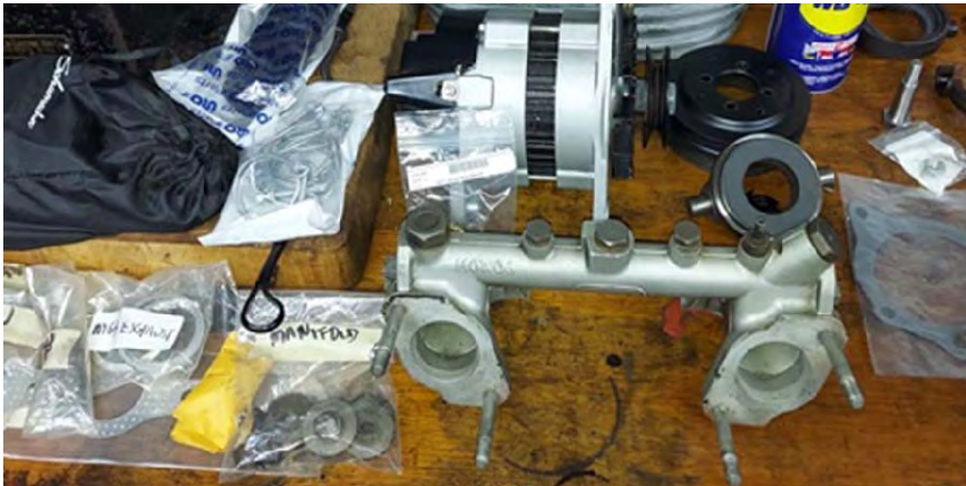
Parts-cleaned, sorted, bagged and labeled – ready for reassembly when it's time.

As you take things apart label them. Plastic baggies, sticky labels, masking tape and a permanent marking pen are necessary. You can use string tags, wire tags, or whatever works for you. Just realize that greasy fingers don't make marking things any easier, and black greasy smudges can render your beautiful penmanship totally illegible when handled. Keep things clean and neat.