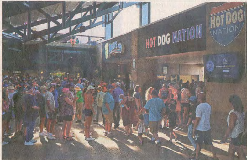
Fans wait in line for hot dogs before the Tides' game Tuesday night. It was Turn Back the Clock Night, which featured 50-cent hot dogs and sodas.

The Tides hosted the first of two Turn Back the Clock Nights this season, with hot dogs, popcorn and sodas for 50 cents each. Fans