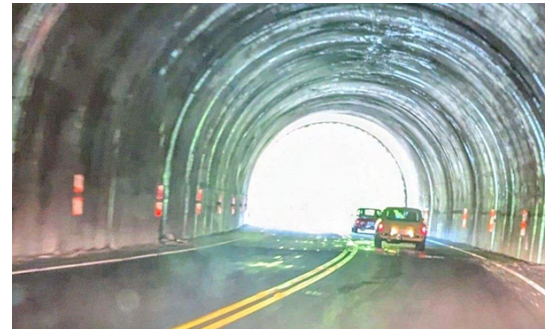
Driving through a tunnel on the Blue Ridge Parkway

We were led by Rob that morning, and he was up to the challenge. He led us to the Blue Ridge Parkway and through the Bluff Mountain Tunnel. What a great drive in the morning!