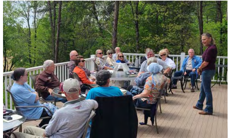
Enjoying the Elk Island winemaker presentation

There must have been an oversight as the Tour Team led us down a gravel road to a VERY steep hill to a parking area that was slanted to match the steepness of the hill. Beyond the parking lot, the Elk Island Winery was an excellent stop with a tasting of good wine served on a wide porch with an interesting presentation from the owner on the history of the winery and her involvement in wine making. A great choice for a stop.