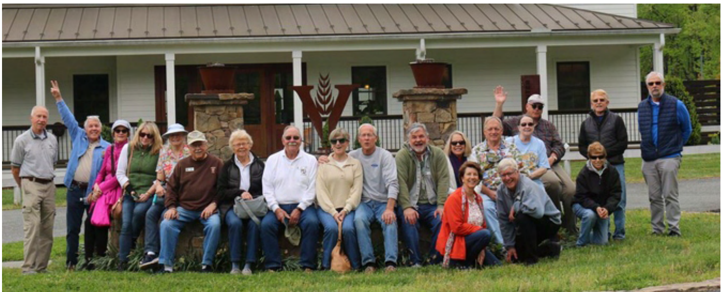
A group photo at the Virginia Distillery