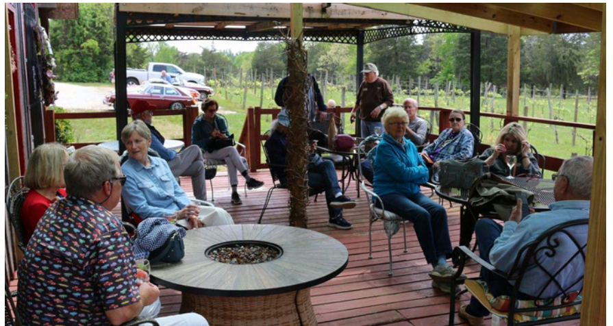
Wine tasting on the covered porch at the Rebec Vineyards

We had a nice (but very brief) stop at Rebec Vineyards. We were a bit behind schedule, but nothing seems to bother this group.