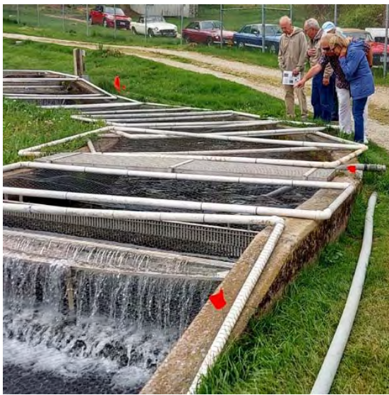
Montebello fish hatchery ponds