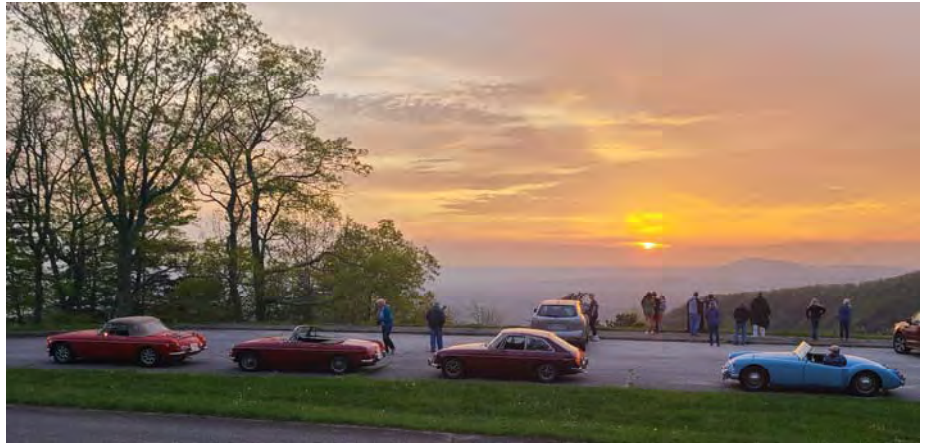
The sunset at the Buena Vista Overlook