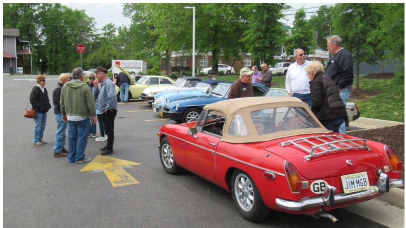
Gathering at the Wawa in Ashland