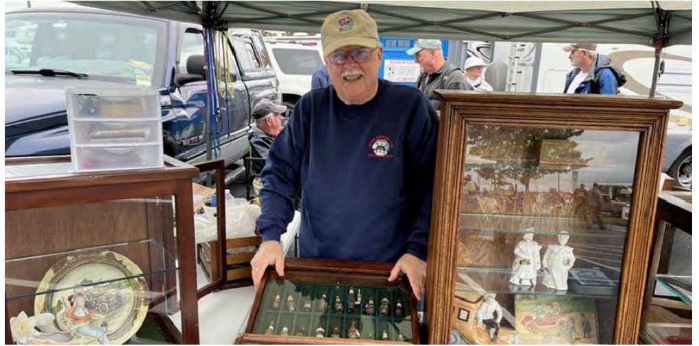
Busy on set-up day at Hershey – spaces in front of Giant Center.

As the largest event of its kind in the world, it draws thousands of visitors and old car enthusiasts into the area, so hotels can get expensive and most fill up. We make our reservations for next year when we check out as do many others.