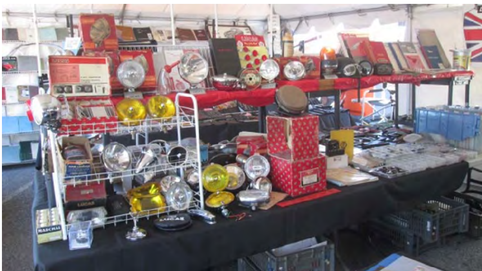
A Hershey booth full of Lucas parts.

Monday of "Hershey Week" is flea market set-up day. It's all open to the public and there is no admission charge. There are nearly 10,000 vendor spaces available. The early bird catches the worm. You can snag some great stuff as vendors are unpacking. You might have to park some distance and walk though, and normally daily parking charges can run to $20. It's BIG so start early and allow at least three days to see most of it.