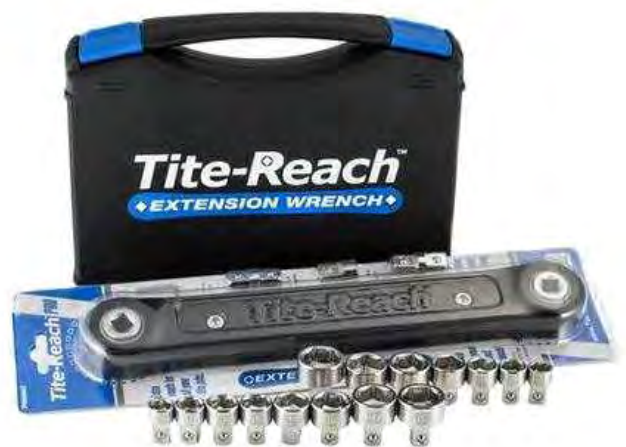
Tite-Reach Kit with case