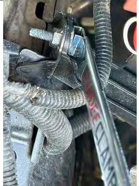
The Handee Clamp in use.

These things sure look handy. It’s simply an alligator clip attached to the end of a pencil type device that can extend by simply pulling.