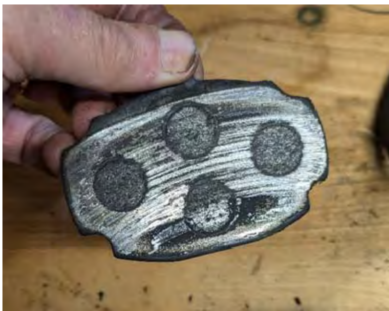
Right: A few years of driving with the brake pad on backwards did a good job of grinding down the metal of the pad!

Sure enough, O rings were showing their age at 55. So, a quick call to Abingdon Spares here in Maine and I had a rebuild kit in short time, the valve rebuilt, and we were back to bleeding. Success. So, two cars, two head-scratching episodes of brake pads getting installed backwards, a call to the Oracle, some spare parts, a firm grip on the trusty 7/16 th and 1/2-inch wrenches, no big deal but I'm reminded how sturdy these cars are. Like everyone, I've had my fair share of people saying "Isn't it hard to get them carbs balanced?" or "I hear the electrics are a mess on those." But the reality is that our MGs are really forgiving. We can drive them with brakes in the wrong position, springs that are sprung, balky transmissions that don't explode when we grind a gear or two, and they keep coming back for more. All they ask is that we drive them instead of letting them sit too long, attend to the leaks that emerge on the driveway outside the wheelbase, and resist the urge to do anything too stupid. Oh yeah, and I'd also add to that list "Try not to make the same mistake twice."