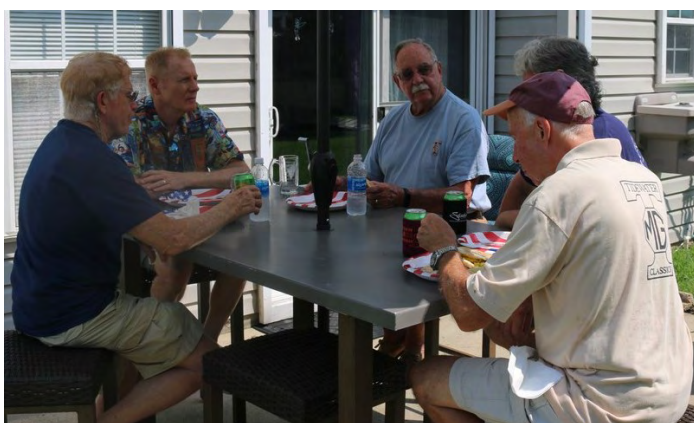
Gathering outside for lunch.