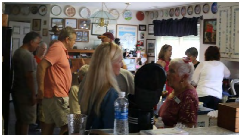
Gathering in the kitchen.