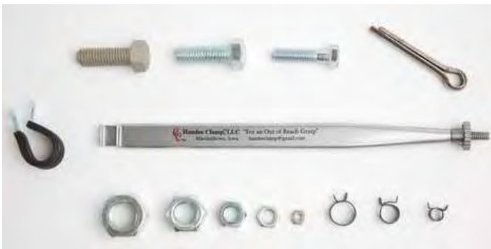
Handee Clamp showing the variety of items that it can be used to help install.

My least favorite bolt and nut combo is those used on carburetor flanges. There is always at least one on the bottom that defies any attempt to hold the bolt while trying to begin threading the nut. I've spent more time on the ground looking for pieces I've dropped than actually working on the car itself!