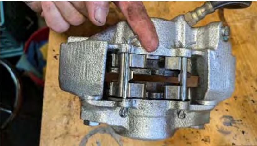
Left: Top pad in place backwards, Brake material against the caliper and NOT the disc!

Fast forward to Maine...I pull the front wheel off of my B, peer in to the caliper and, you guessed it, many years ago I installed the exact same bad backwards on the B!