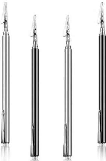
Extendable alligator clips

I’ve got a drawer in one of my tool cabinets filled with medical instruments like clamps, tweezers, and other neat items. Some have locking handles, serrated jaws and curved tips on them. They are great to help hold or clamp small pieces while placing things into tight areas where your fingers won’t reach. There is also a selection of dental picks in that drawer that have proven handy when working on small items. The possibilities are endless and it’s one of my go-to places for something special when needed.