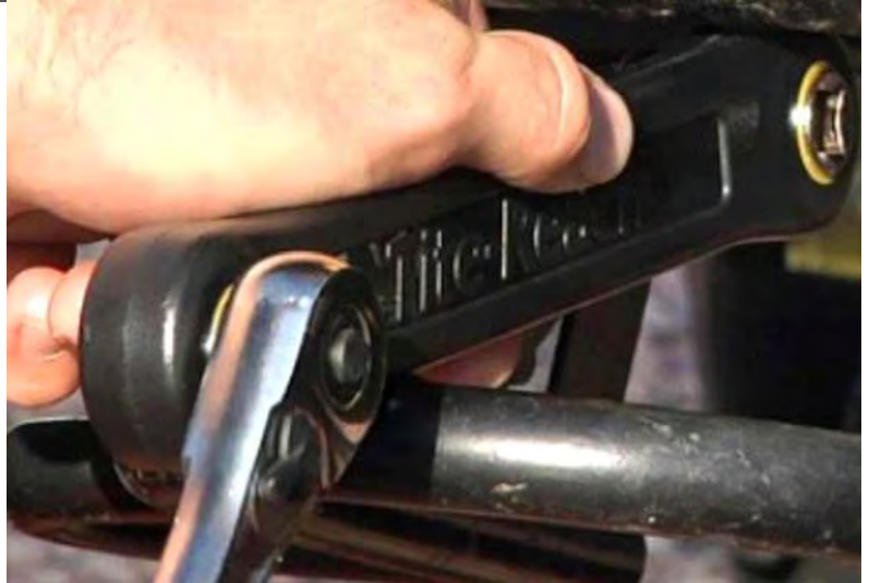
Ratchet extension in use.

A sturdier but more costly version is produced by