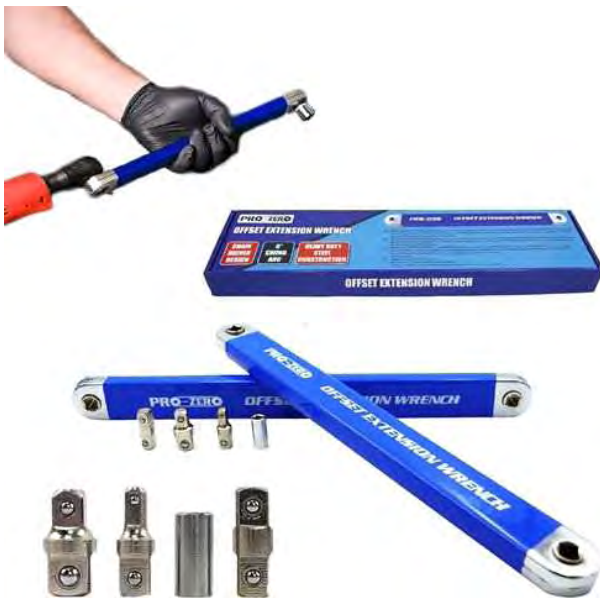
Ratchet Extension with adapters for various sized sockets

experience using these please chime in by email or at our next meeting. We should have them on-hand at our November tech session though so you can check them out before you decide to give any hints to your own personal "Santa."