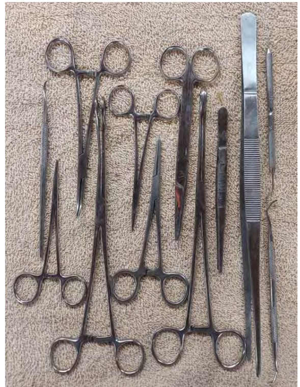
Various medical/surgical instruments

This clever device is meant to help you tighten bolts and nuts in areas where you can’t fit a ratchet and socket combination.