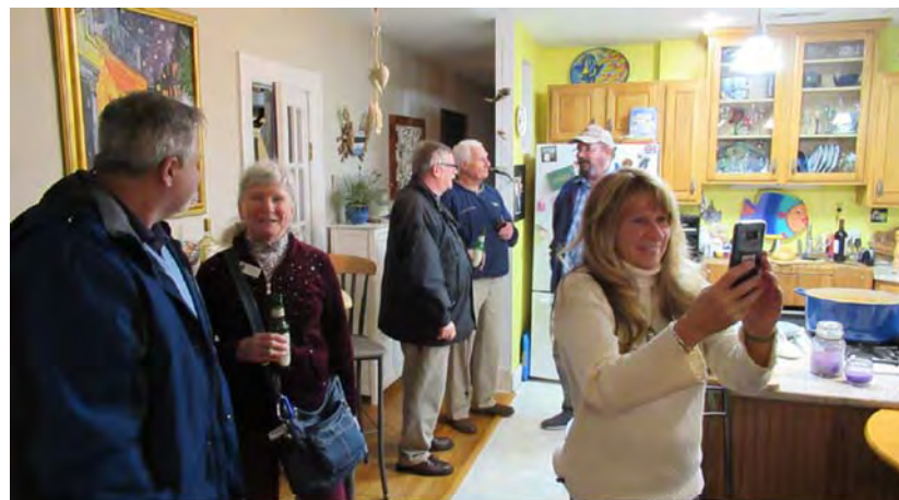
Our hostess records the event